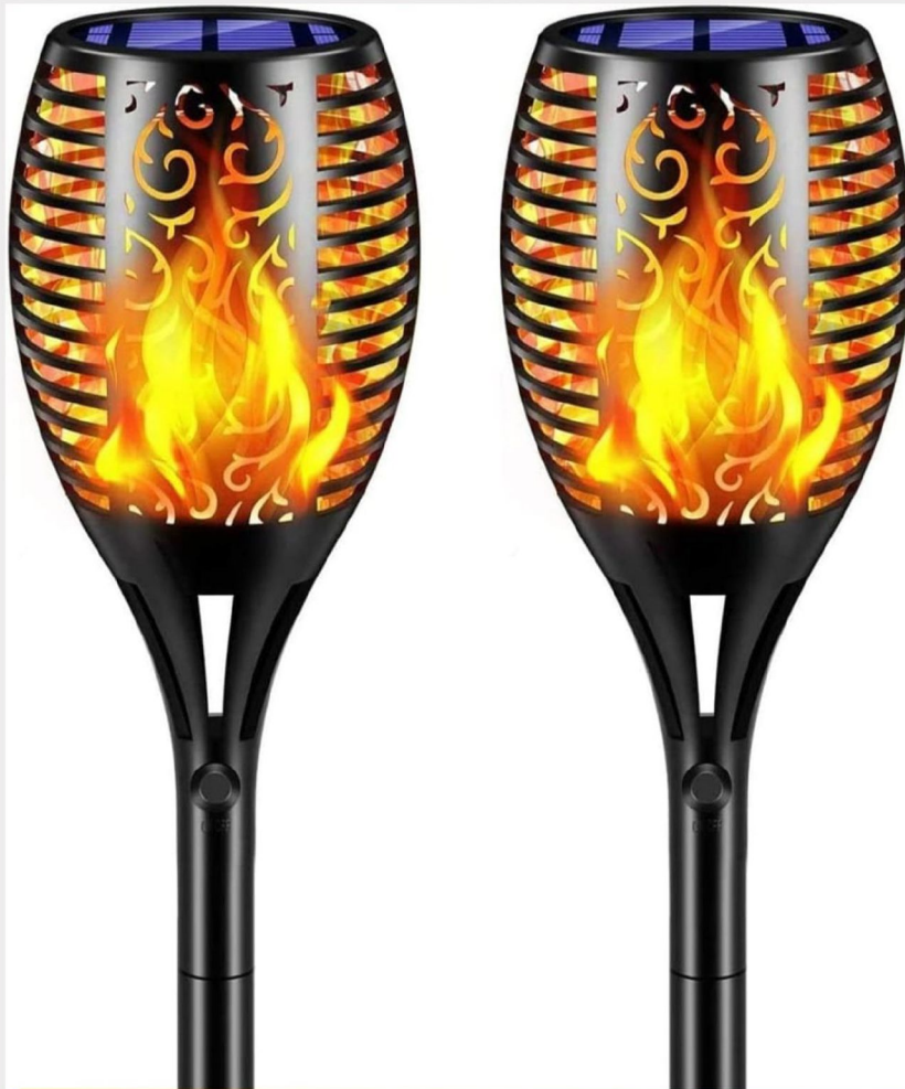
Solar Mashal Light