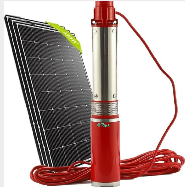
Solar Water Pump