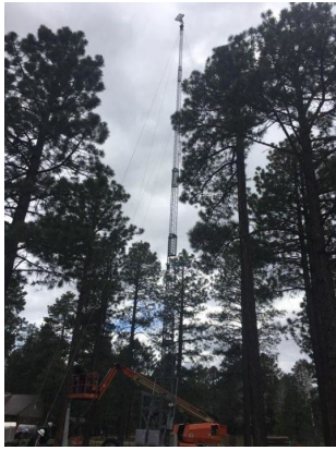
Temporary Verizon Cell Tower