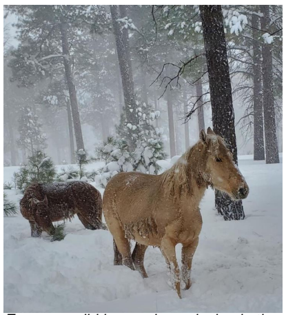
Even our wild horses love playing in the snow!