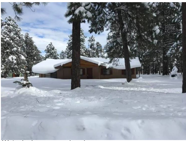
We're in there somewhere!