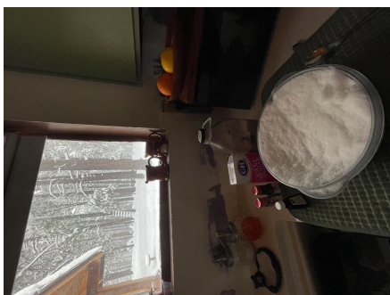
We took our snow creation indoors and made some snow ice cream using chocolate milk, sugar, vanilla, and some of our favorite toppings. Super simple and yummy/only had to worry about brain freeze as opposed to actually freezing outside

Thank you to those who shared some snow pictures from the week of January 24th's big 36" snowfall. It seems that most activities were enjoyed indoors by the fireplace. Most of the pictures shared were found on the Forest Lakes Bulletin Board page.