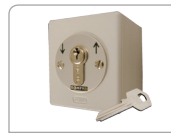
SOMFY 240V with Key Switch