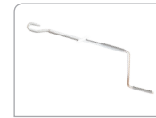
SOMFY 240V with CSI override