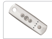
SOMFY 240V RTS with Transmitter