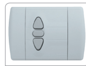
SOMFY 240V with Inis Uno