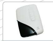
ODS with E-Port