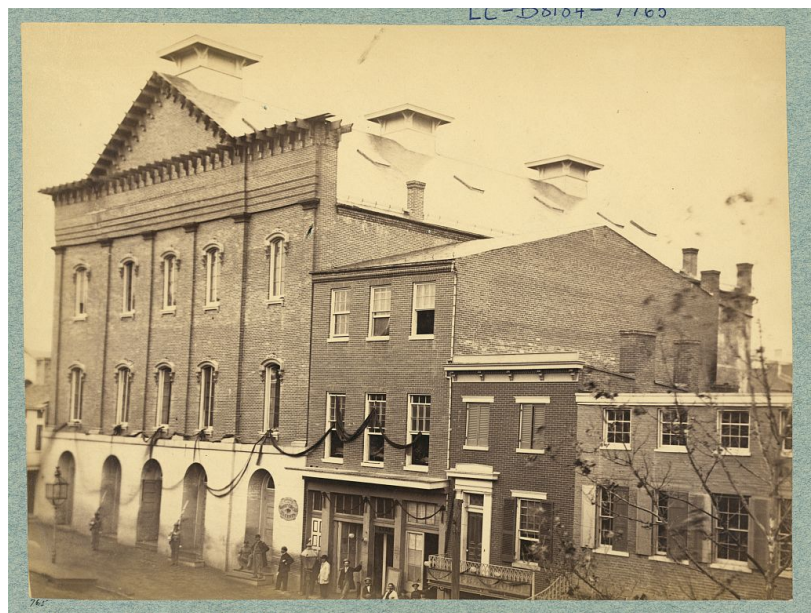
Ford Theater draped in mourning.

as we had not had a pay day for some time we were all shy. But we all in unison said he must go, and we would be waiting around close to accompany him home to camp after the performance was over. Finally he considered he would and did go up and we enjoyed ourselves as well as we could and were so happy that the 'cruel war' would now be over.