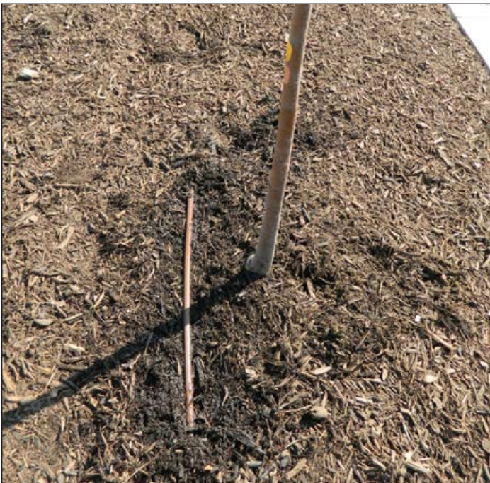
Drip irrigation delivers water on a timed basis.

Do not operate a drip irrigation system without a timer or without understanding water output. It is not possible to gauge the moisture content of the soil ball by observing the wetting of the soil surface. If the soil ball gets too wet and has inadequate drainage, disease problems will arise.