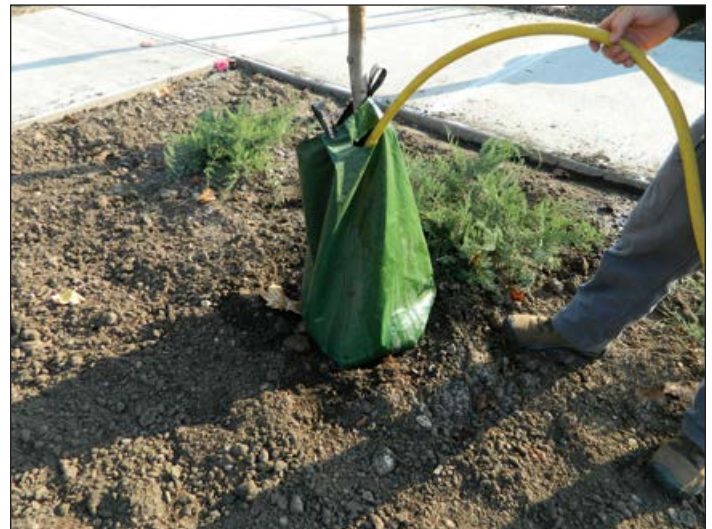
Drip irrigation bags allow slow delivery of water to the soil root ball.