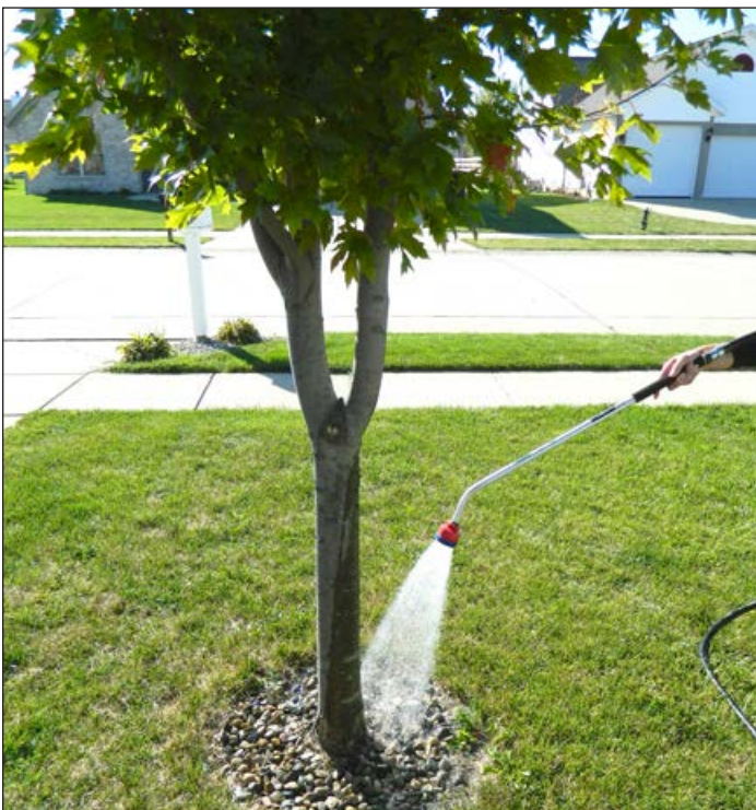
Apply water using a breaker to minimize runoff.