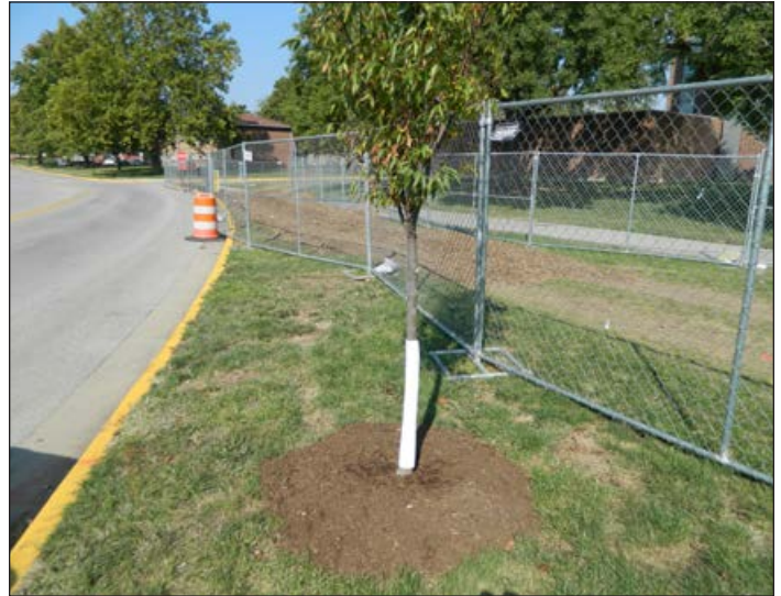
Mulch and trunk protection helps with moisture loss and damage.