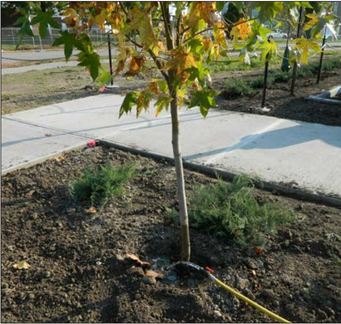
Water trees whenever rainfall is insufficient.

that trees have adequate moisture to survive the winter months and are ready for spring growth. Nighttime irrigation is optimal, as this is when the tree is physiologically catching up with the water loss during the hot daytime temperatures.