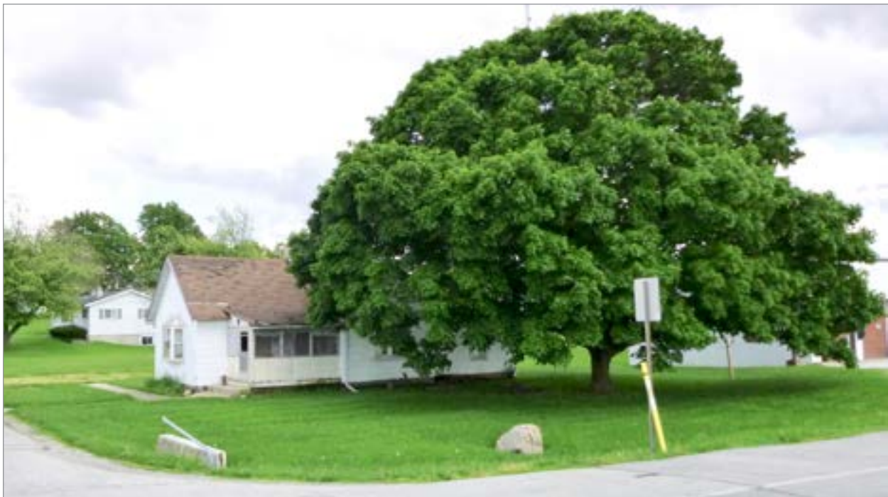
Tree appraisals must be reasonable and defensible.