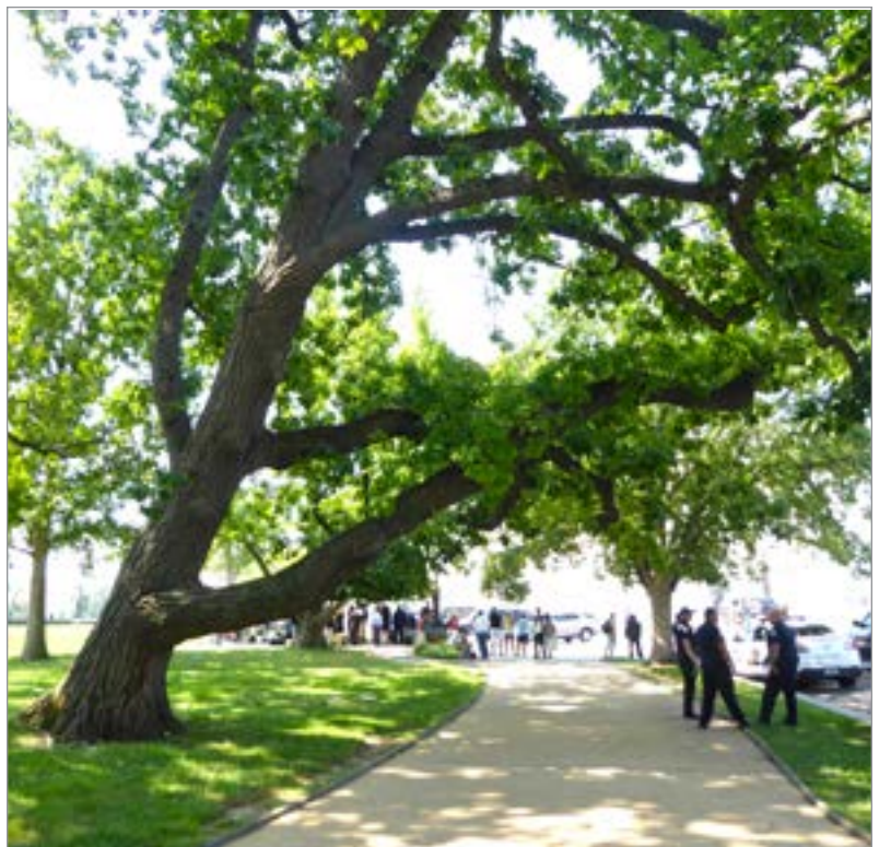
Tree condition and form play a major role in depreciation of plant value.