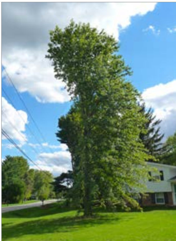
Depreciation can be significant where overhead utilities are present.

International Society of Arboriculture, Certified Arborist: https://www.treesaregood.org/findanarborist