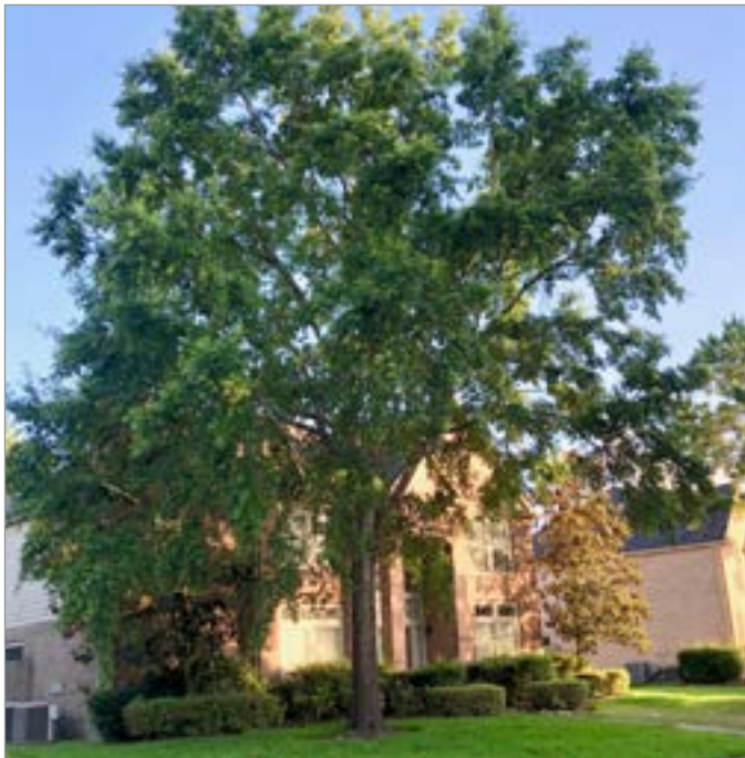
Evaluation of the structural integrity and overall health of trees is an important component of the appraisal process.

Three methods used to appraise trees and landscapes — Cost Approach, Income Approach, and Sales Comparison Approach — are described in the Guide for Plant Appraisal , 10th edition. Authored by the Council of Tree and Landscape Appraisers (CTLA), published by the International Society of Arboriculture, and endorsed by major arboriculture and horticulture organizations, this guide represents a critical resource for sound plant valuation.