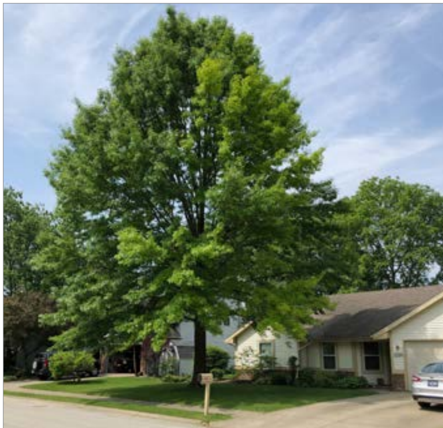
Properly placed trees can add value to your home and property.

When applying depreciation factors toward overall basic cost, a professional appraiser will assign a rating to each of these three depreciation categories: condition, functional limitations, and external limitations. The overall basic cost is multiplied by the determined value in each of these three categories to estimate the depreciated cost — the final functional reproduction value using the Trunk Formula Technique.