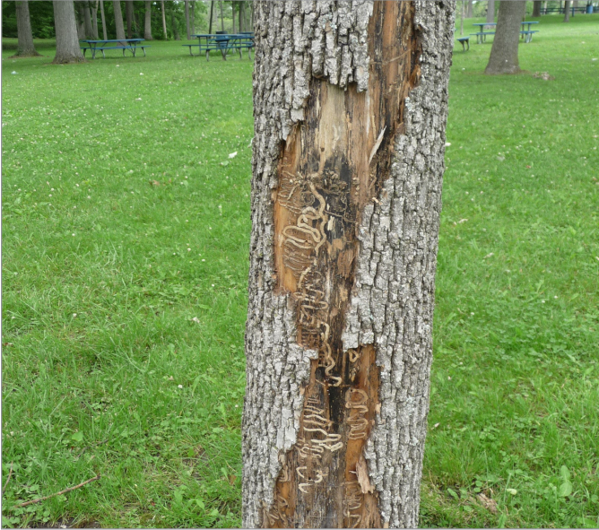
Figure 9. Insect feeding damage can lead to injury and decay.