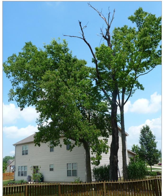
Figure 2. Defects which lead to increased likelihood of failure will have significant impact on nearby targets.

in failure potential. It's important to include that not all defects may be visually available to inspect or analyze. Unseen defects might be underground, such as root issues. Decay hiding within an apparently normal trunk also will be hard to detect with a visual inspection.