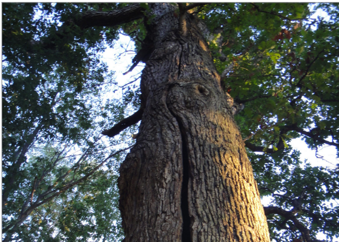
Figure 10. Seams and cracks from lightning damage can lead to extensive decay