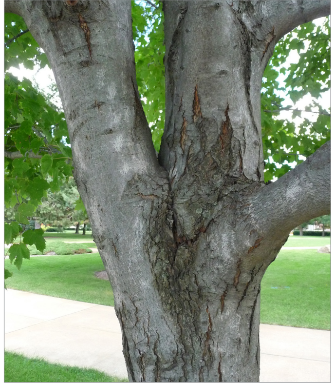
Figure 7. Tree with 2 or more main stems about the same diameter emerging from the same location on the main trunk are prone to splitting.