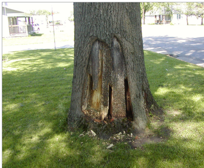
Figure 12. Heart rot occurs in the center of a stem or branch reducing structural strength of the tree.

Locations of decaying wood and other defects are important in the inspection process.