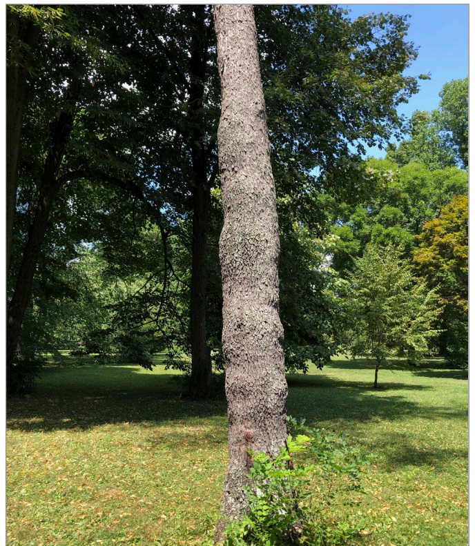
Figure 8. Internal decay causes pressure which can distort the trunk causing ripples.