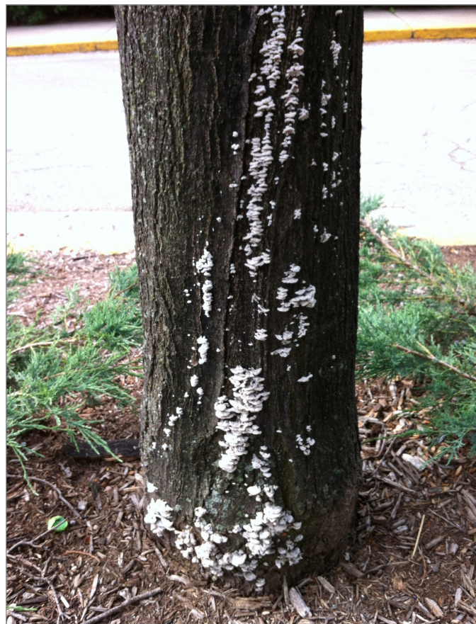
Figure 13. Loss of sapwood from disease is a defect that can contribute to tree failure.

Most decays start from the inside, working out and are called heart rot (Figure 12). This is a condition of concern in any tree, but the extent and location are of critical importance relative to likelihood of failure. This type of defect is common in many trees but isn't always a major defect. Hollow trees resulting from heart rot are not all dangerous. The extent and location of decay are major determinants of strength when rot is present. Heart rot, which decays the internal part of the tree is not always a serious risk consideration. Where is the living portion of the tree? It is in the cambial tissue where the xylem and phloem are developed in the outer rings of the tree. Also, secondary xylem vessels - containing cellulose and lignin - are essential for tree strength. Some guidelines recommend a minimum of 2-3" of sound living shell for every 6" of diameter. Regardless, the type of fungal organism and location of the decay are critical.