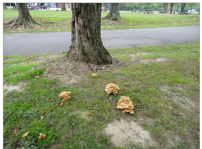
Figure 15. Fungal fruiting bodies in the root zone indicate defects which include decaying roots.