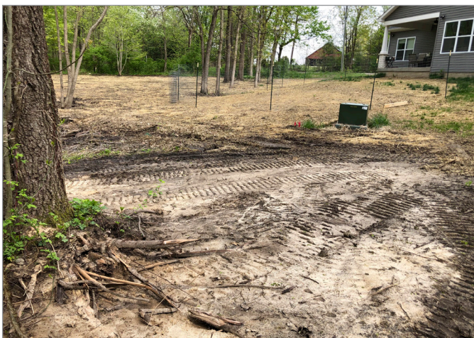
Figure 11. Heavy equipment compacting soil and damaging roots can create high risk defects.