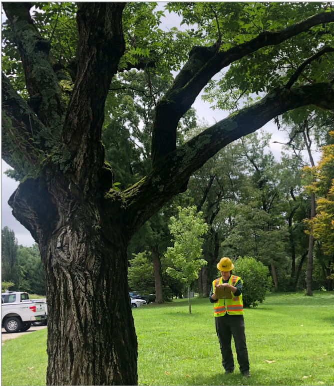
Figure 1. Tree inspections are an important part of overall tree care and maintenance strategies.

Every tree inspection should be recorded and kept safely filed for future reference. There are management considerations and legal implications for documenting the review of a tree or trees on a site. Records of past inspections can show how a tree has changed in its health and structure over the years. These past inspections can aid in determining management strategies and risk mitigation for the tree owner. Also, written evaluations can help to minimize liability if a failure occurs and a claim is filed against the tree owner or the company providing services.