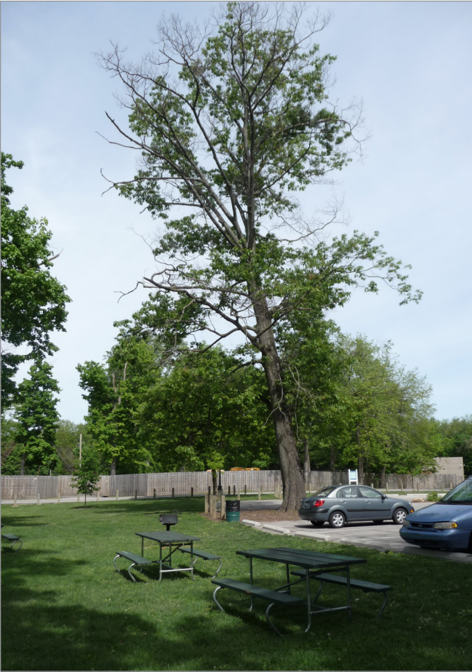
Figure 5. Unhealthy, stressed trees can have defects with increased likelihood of failure.