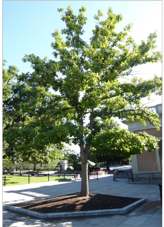
Figure 14. Codominant stems with included bark in the union is a defect that increases the likelihood of failure significantly.

It is critical to investigate the root system for defects as well. Inspect the ground below the dripline for roots exposed from wind throw or construction impacts. A helpful tool for detecting defects in the root system are fungal fruiting bodies (Figure 15).