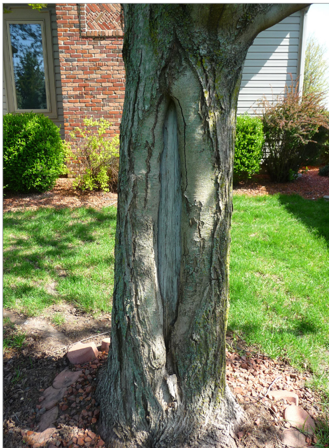
Figure 16. Previous wounds are evidence of mechanical damage which may increase likelihood of failure, depending on the development of wound wood.

Mushrooms growing under the dripline of the tree are indicators of a potentially compromised root system. However, these fungal identifiers are not always present. Mushrooms are only present at certain times of the year, dependent on the decay organism.