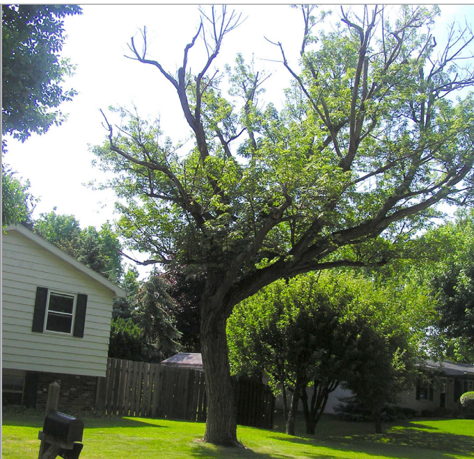
Figure 6. Dieback in the top of a tree can indicate a defective root zone.