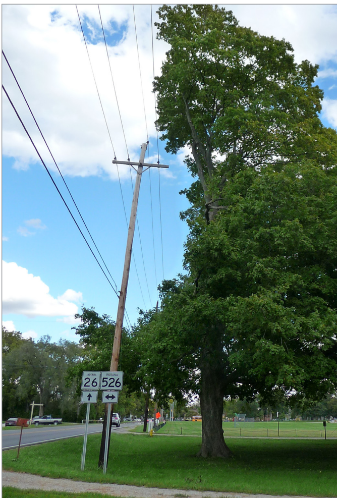
Figure 3. Crown shape that is unbalanced can lead to twisting, resulting in cracks and potential failure.

severe utility pruning, can create defects leading to failure (Figure 3).