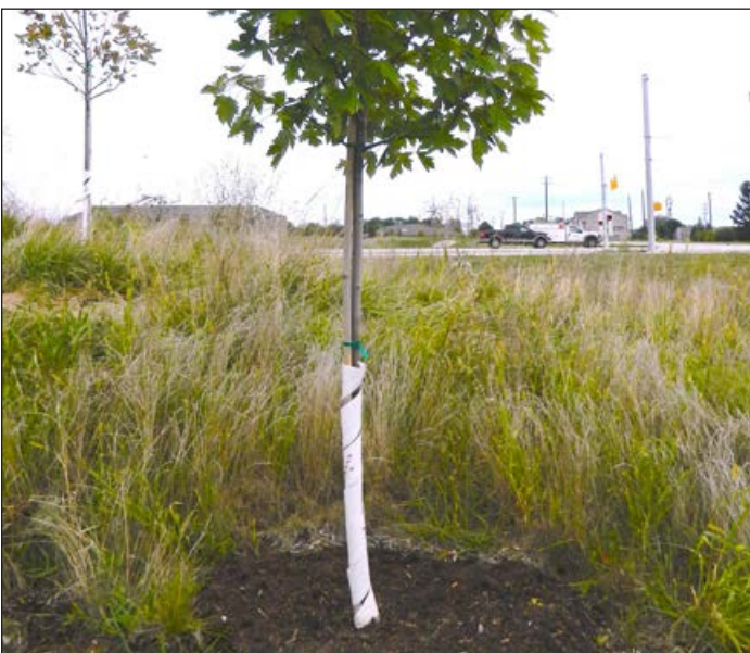
Flexible, expanding light-colored wraps provide protection for smooth-bark trees.