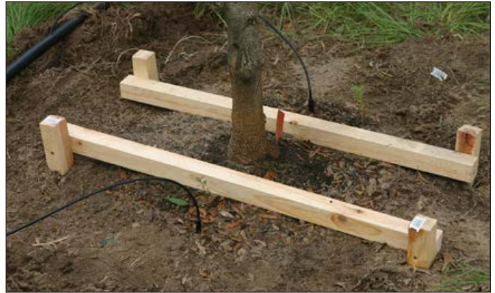
A wooden frame can provide support for balled-and-burlapped trees and can be easily covered with mulch to hide the support system.

Underground stabilizing systems are also effective and economical for stabilizing the root balls on larger balled-and-burlapped trees. There are several commercial anchor systems available. However, a simple untreated wood frame held in place with wooden stakes can provide an aesthetic option which degrades naturally over time. Vertical stakes are attached to the ends of horizontal boards over the ball. Stakes should be driven up to 4 feet deep, or as deep as possible in the existing soil to keep them from getting loose or pulling out. The system can be easily covered with mulch after installation.