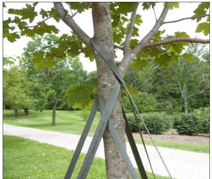
This newly transplanted tree is guyed with flexible webbing materials.