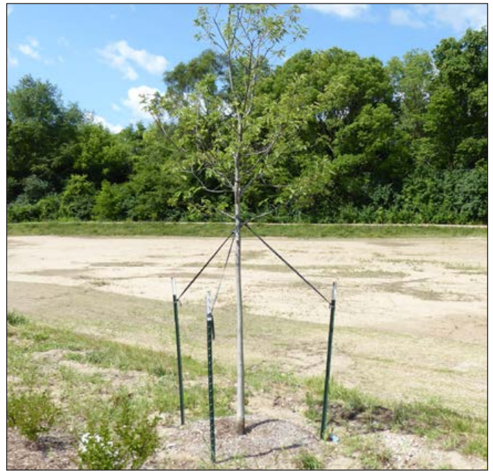
A properly staked and guyed tree.

Staking connects the trunk to a nearby steel or wooden post. This is a common approach on smaller trees or containerized tree stock. These posts are usually from 2 to 6 feet long and are driven vertically into the soil near the trunk. One to four stakes may be used to support a tree. Typically, two to three stakes with separate flexible ties are recommended. Proper tension is important in staking; allow some movement for trunk and root development. If a single post is used, it should be placed on the windward side of the tree and typically used with a fabricated, specialized device.