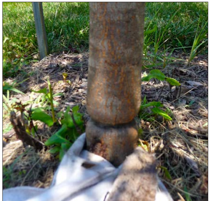
Tree wraps can girdle the trunk, causing damage and even death.