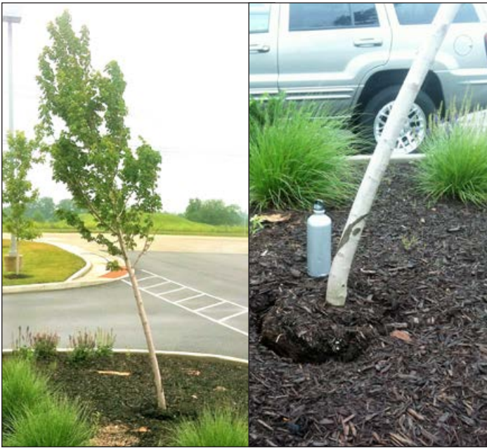
Trees in exposed areas and lightweight root balls are easily displaced, disrupting root growth and establishment.

An additional advantage of tree supports is that the staking materials provide physical barriers against mechanical damage of tree trunks, particularly damage due to lawn mowers and other lawn equipment (see FNR-492-W, Mechanical Damage to Trees ). They act as a visual cue to stay away from the tree, because equipment may be damaged. Leaving the stakes as tree guards after the supporting guys are removed from a tree may be useful as long as they don't pose a hazard. Staking and guying trees in areas of heavy public use such as city parks and playgrounds should include mulch rings outside the support system area and high-visibility tape as an extra precaution to prevent tripping or other accidents.