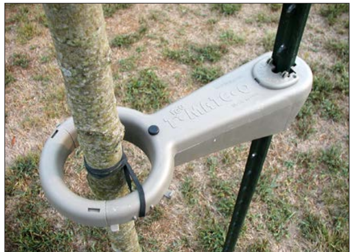
A specialized staking device is used with single stakes.