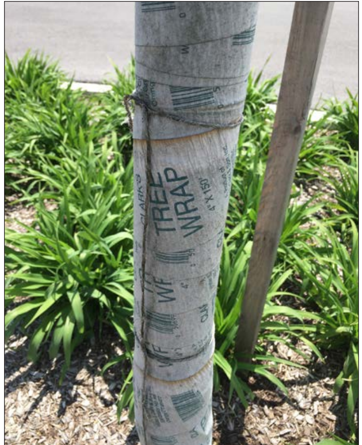
Paper wraps are ineffective in providing protection; they harbor insects and diseases.

Use of tree wraps is often a contentious point among researchers and practitioners. Studies of common tree wraps have shown that they do not prevent extreme fluctuations in temperature on the bark which cause sunscald. In some cases, the temperature extremes are worse. Tree wraps are also quite ineffective in preventing insect entry. In fact, some insects like to burrow under them. A tree wrap can also kill a tree, if not remove before it begins girdling the tree.