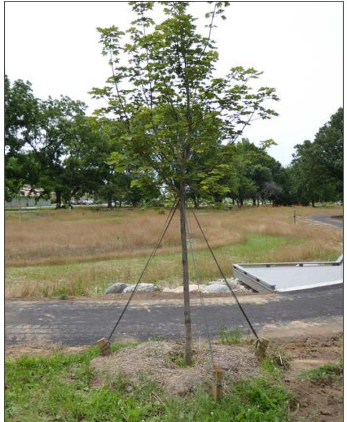
Tree guyed with three points of attachment, less than 2/3 the height of the tree.

Guying is temporary and typically used on larger trees that are transplanted balled-and-burlapped. Three points of attachment provide the best support for these large-tree installations. Often this is done by attaching a wire to an anchor and slipping it through hose material around the tree. However, the hose material and wire can cause damage from abrasion at the attachment point. It is best practice to use wide, smooth, flexible tie-materials such as soft webbing weave, that can help dissipate pressure exerted on the tree where it attaches. This minimizes abrasion and damage to the cambial tissue just beneath the bark on the trunk and stems.