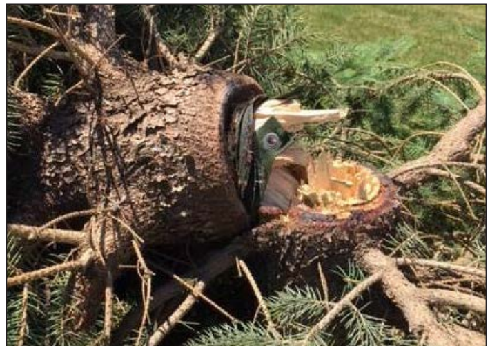
A tree guyed too long will girdle the tree at the attachment point, resulting in failure.