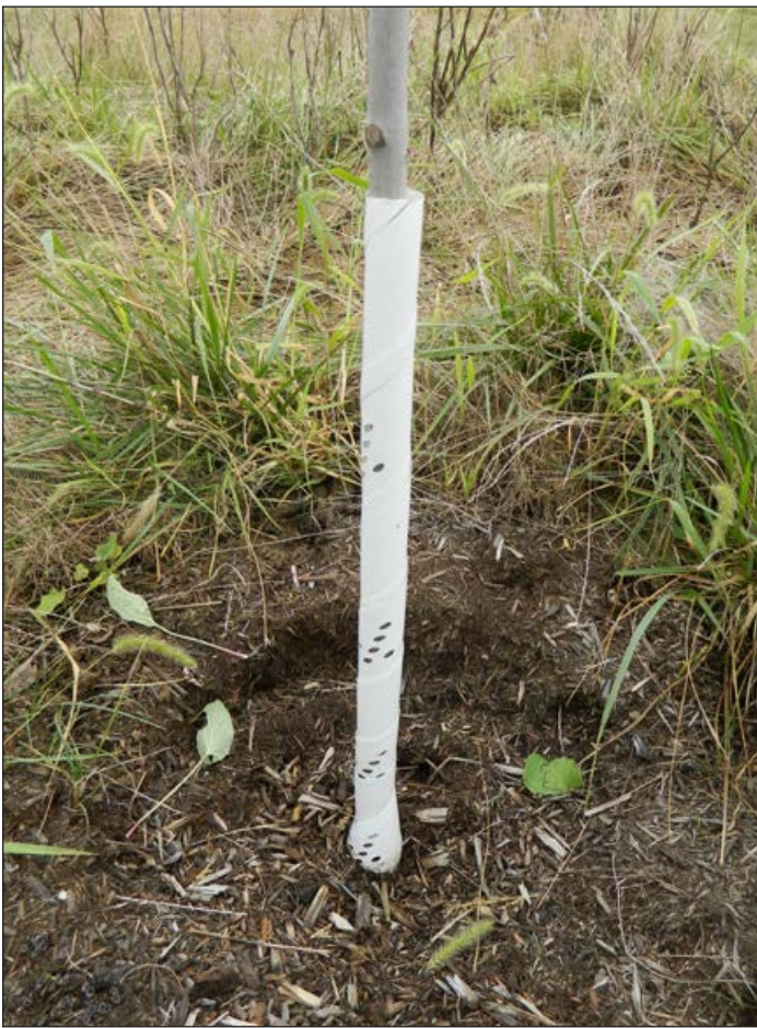
Flexible wraps expand as the tree grows, which prevents the chance of girdling the trunk.

Tree support systems such as staking and guying should only be considered when conditions and exposure to the wind make it necessary to keep a tree upright. When staking and guying is deemed essential, install all supports properly to prevent damage to the tree and remove them as soon as possible—usually after one growing season. Review the system regularly and adjust it as needed to ensure the equipment is functioning properly.