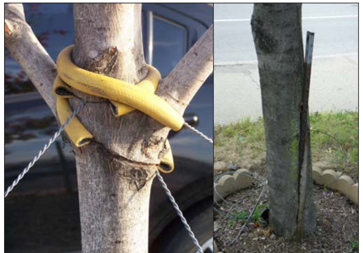
Support wires left too long can girdle the tree, either killing the tree or making it more likely to break off. Stakes left in the ground create a hazard and damage tree structure.