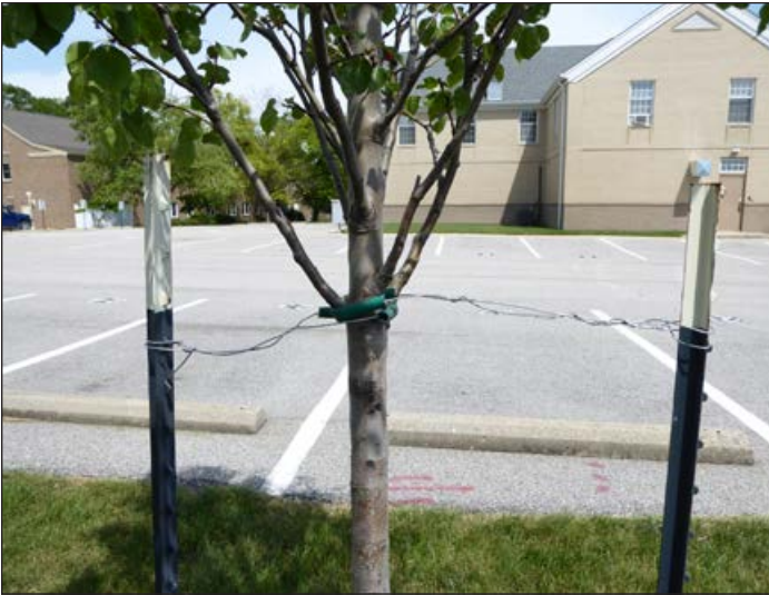
Poorly chosen staking materials and improper tension cause damage and do little for support.