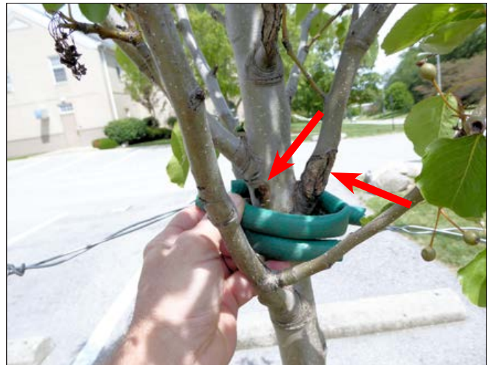
Cambial tissue can be damaged by improperly installed support materials. Note the wounds where the hose was resting.

There can be distinct disadvantages. Improperly staked trees suffer from poor development such as decreased trunk diameters and smaller root systems—and may be unable to stay upright after you take the supports away. Often trunk tissue suffers from rubbing and may even be girdled by support materials. Also, due to poor development and taper, previously supported trunks are more likely to break off in high winds or blow over after stakes are removed.