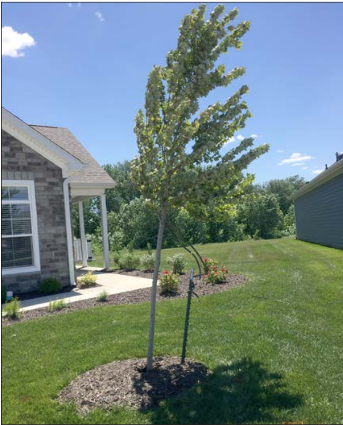
Loose ties and inadequate supports allow tilting in the planting hole, loosening roots from the soil.

When guying, attach the guy-wires on the lower half of the trunk, always less than \frac{2}{3} the height of the tree to reduce the chance of the tree breaking at the attachment point. Proper tension is important for support, but some movement should be allowed to stimulate trunk taper and root anchorage. Excessive tension in the guying material can cause the trunk to break where it attaches as the tree bends in the wind. Poor tension, or too loose provides no support for the tree.