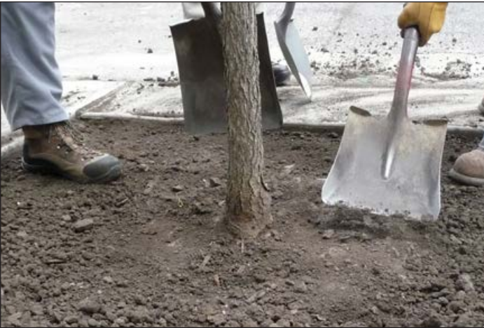
This tree was established at the proper grade after finding root flare.