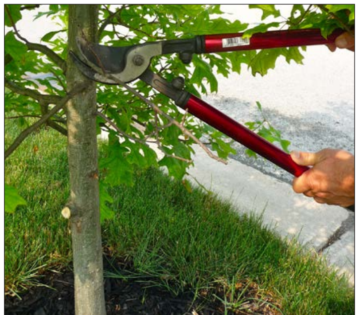
Pruning should be minimal, removing only dead or damaged branches, as needed.