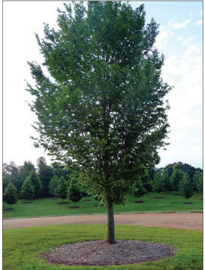
Whenever possible, mulch trees to the dripline of the tree canopy, at the edge of the farthest limbs, at 2–4 inches deep.

Young trees need protection against animals, frost cracks, sunscald, lawn mowers, and string trimmers. Mice and rabbits frequently girdle small trees by chewing away the bark. Since the tissues that transport nutrients in the tree are located just under the bark layer, a girdled tree often dies in the spring when growth resumes. Weed whackers or string trimmers also are a common cause of girdling. Plastic or vinyl guards are an inexpensive and easy control method. Sunscald and bark cracks occur mostly on the south and southwest sides of smooth-barked trees. Sunscald and frost cracking are caused by the sunny side of the tree expanding at a different rate than the colder, shaded side. This can cause large splits in the trunk and can occur when a young tree in a shady spot suddenly is exposed to