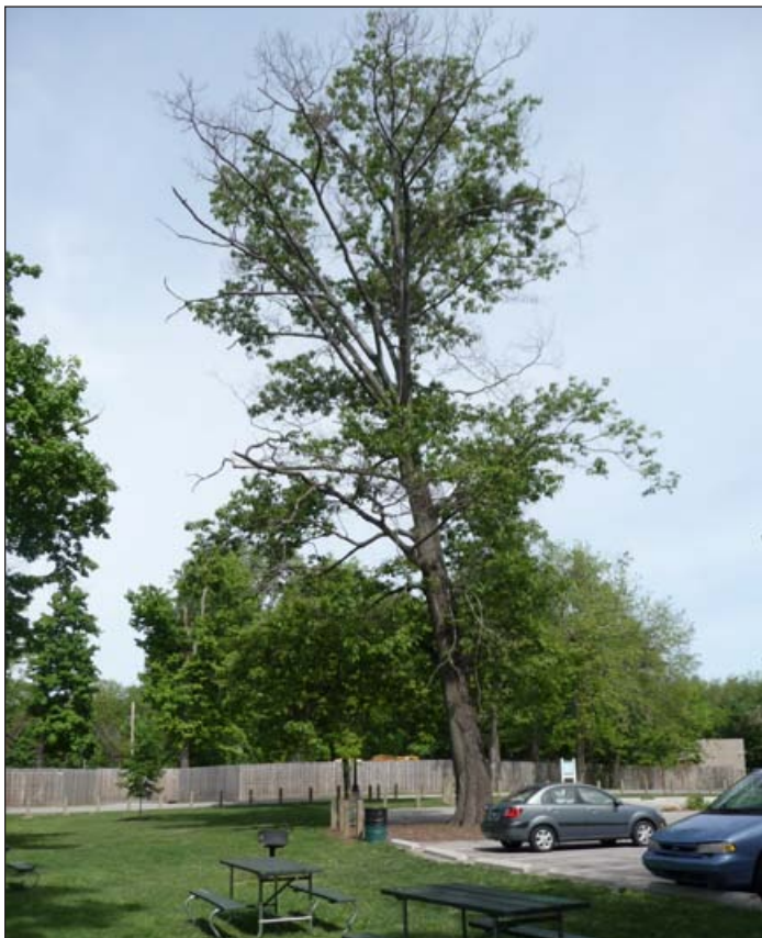
Inspect trees for health conditions and defects during the tree risk assessment.

Document and maintain records: Every inspection should be recorded and kept on file for future reference. These records are important for several reasons. Past evaluations can show how a tree has changed in its health and structure over the years. Also, written assessments are beneficial in liability claims and court cases. These written evaluations could minimize liability if a failure occurs and a claim is filed against the tree owner.