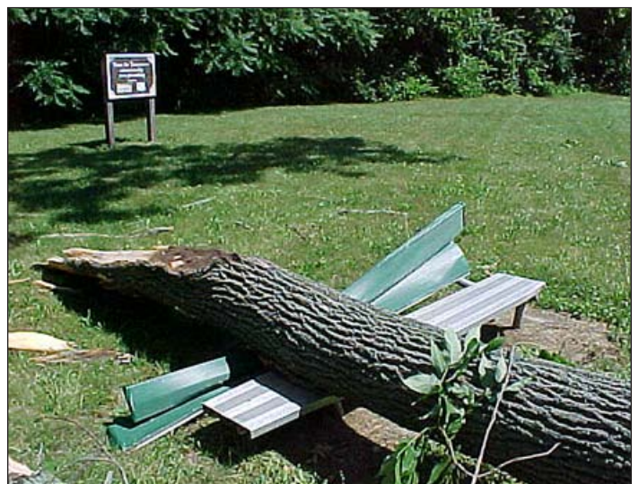
Identify potential targets for tree failure.

A target is people, property or activities that could be injured, damaged or disrupted by a tree failure. Tree owners must carefully assess the area around homes, playgrounds, sidewalks and parking areas. Is the target static, moveable or mobile? Consider whether people can be kept away or separated from the target area. Also, assess the target's value and potential. Review the target zone, which is the area where the tree or a branch is likely to strike when it falls, to determine consequences of the tree's failure. The target zone should include the areas inside a circle around the tree, which is at least as wide as the total tree height.