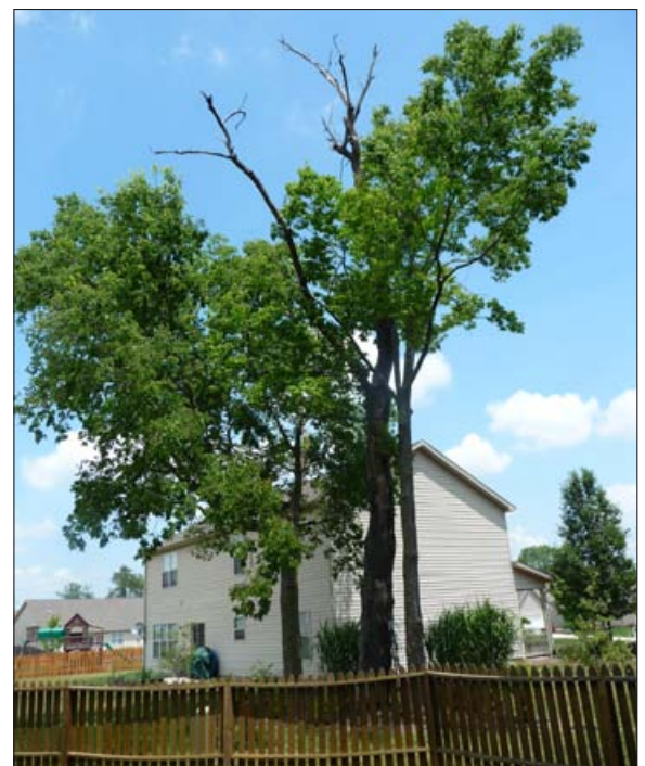
Unhealthy trees can fail, causing potential damage to nearby homes.

Reduce tree liabilities: The property owner or manager has an obligation to periodically inspect trees for unsafe conditions. Since all trees have risk associated with them, regular inspection compels the owner or manager to evaluate the amount of risk they are willing to assume. Tree risk assessment is an important part of a program to determine if a tree is structurally sound or has the potential for failure. Inspections show that the tree owner is actively managing their trees and could reduce the owner's liability if a failure occurs.