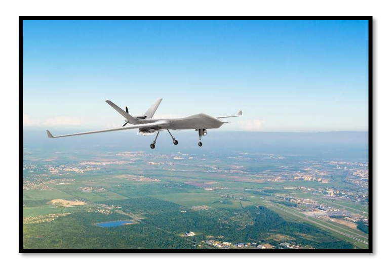
Figure 4: UAV Implementation for Inspection

powered sensors and cameras to conduct visual inspections of aircraft surfaces. These UAVs can navigate confined and challenging spaces within aircraft structures, providing comprehensive inspection data with unparalleled accuracy. The integration of AI-powered UAVs enhances the safety and efficiency of aircraft maintenance operations, reducing downtime and ensuring optimal performance [10].