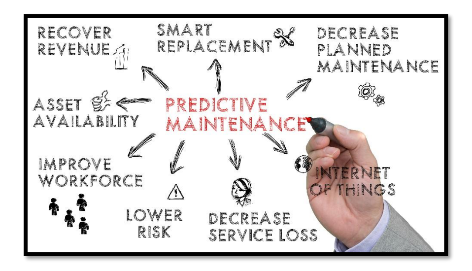
Figure 6: Advantages of Predictive Maintenance

The future of manufacturing will witness a pronounced expansion of predictive maintenance strategies powered by AI algorithms. Research indicates that AI-driven sensors and analytics will facilitate real-time data monitoring, enabling more effective fault detection and predictive maintenance. By accurately forecasting equipment failures, manufacturers can proactively implement preventive measures to avoid costly downtime and production disruptions. The integration of AI-powered predictive maintenance is expected to drive continuous process improvement, prolong the lifespan of assets, and optimize overall equipment effectiveness (OEE), contributing to heightened operational efficiency & cost-effectiveness [11].