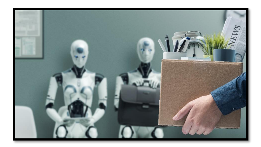
Figure 2: Robotics and the Human Factor