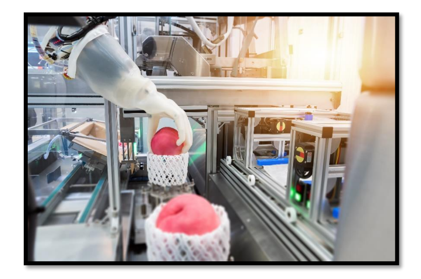
Figure 5: Collaborative Robots (Cobots) Assisting Human Processes

enable a transformative paradigm shift in human-robot collaboration, opening new avenues for innovative applications across diverse industries [3].