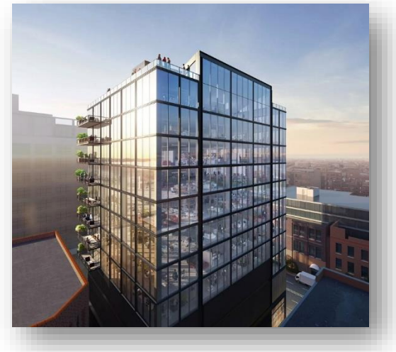
Figure 2 Fulton East, Chicago

Space utilization, also known as space occupancy, is a critical aspect that IoT sensors can effectively address within buildings. Researchers have explored various sensor technologies to monitor and analyze space utilization patterns. Recent advancements in space utilization research have focused on heat sensing techniques such as thermal imaging or temperature grids, which enable estimation of space occupancy. Additionally, sound-based detection methods have been