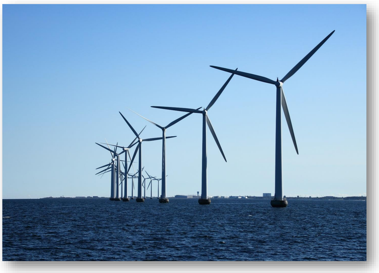
Figure 7 Copenhagen Sea Turbines