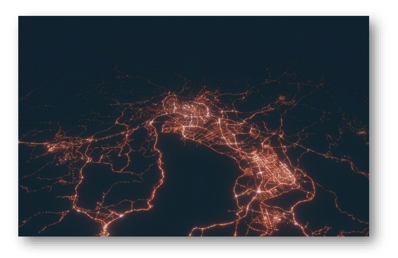
Figure 3 Kumming City, Aerial Night View