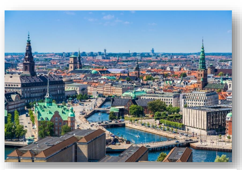
Figure 6 Copenhagen aerial view

The smart grid incorporates advanced technologies and IoT to create an automated energy