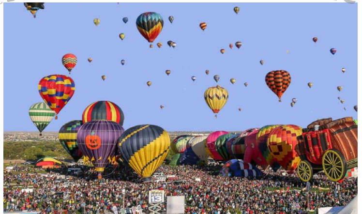
Head for the Mountains 10