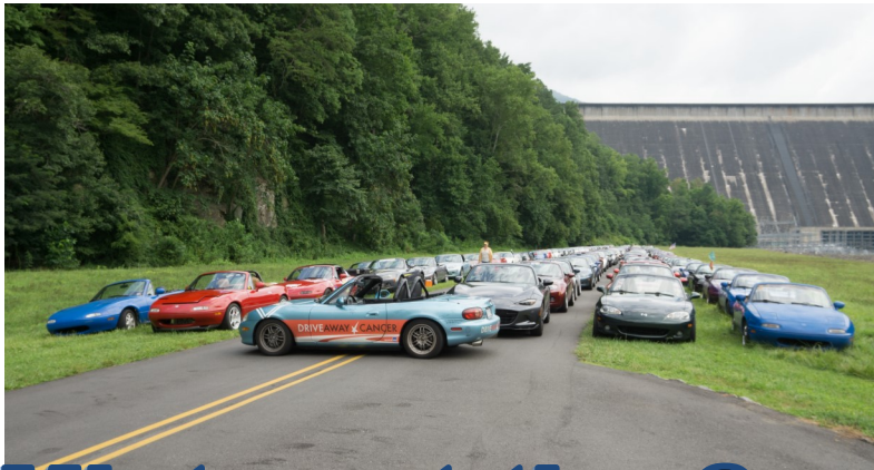
Miatas at the Gap