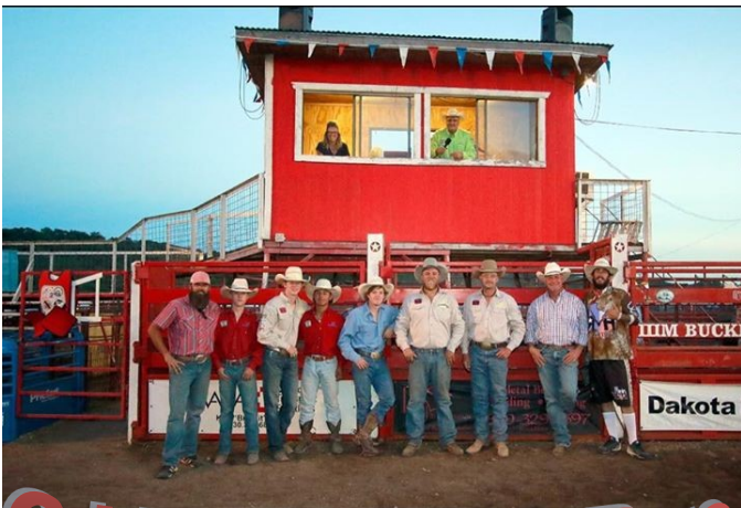
Crider's Rodeo Run