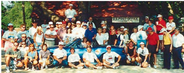
Group shot of the Club's Inaugural Run in 1995