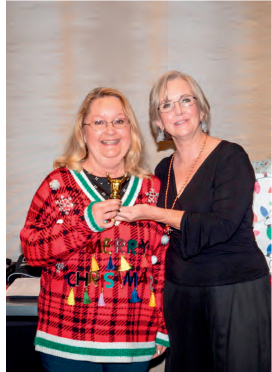
Top two pictures: This year's winners of the ugly sweater contest Second row, right photo: 2020 Board of Directors