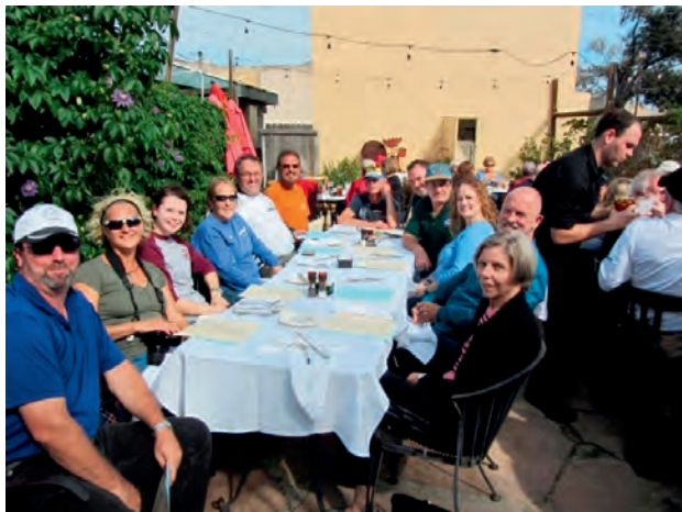
Eating good on the November 14, 2015 Painted Churches R