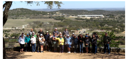
This photo illustrated the altitude and amazing view atop the mountain. Below is a closer view of our folks.