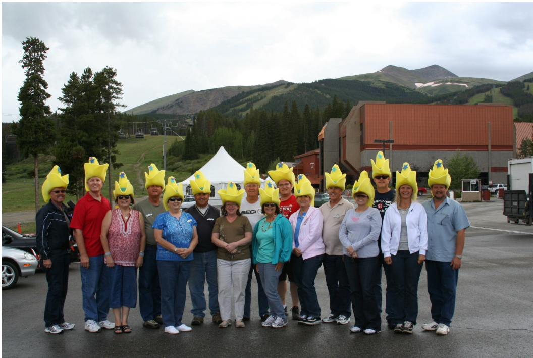
Romp Through the Rockies, 2010