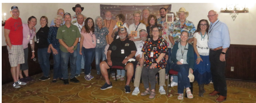
Bluebonnet was there in force!