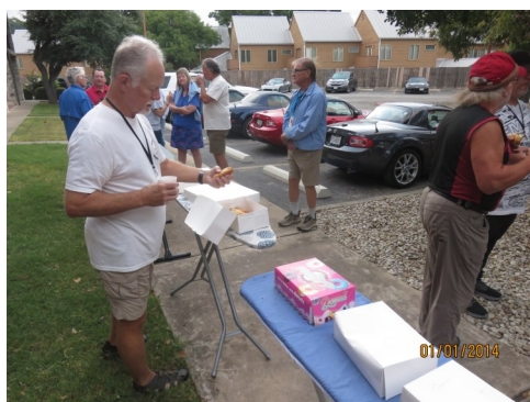
We had "breakfast on the boards".