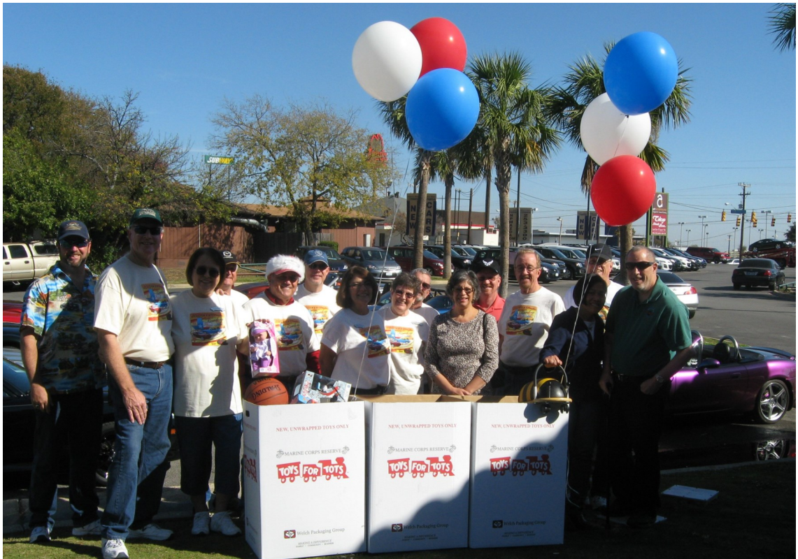
Toy's for Tots at North Park Mazda, 2010