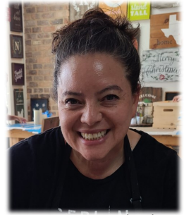
Our new president!