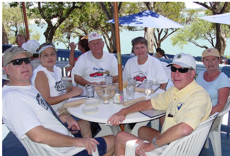
2006 Oasis Run