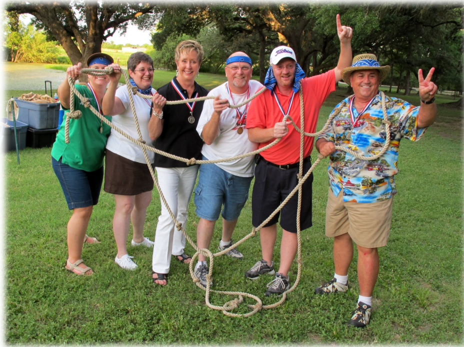
2010 BBMC Shady Oaks Summer Fun