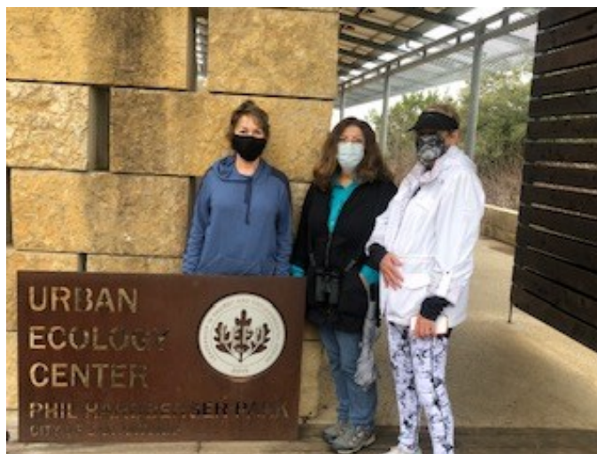
The Ladies visited and hiked at Phil Hardberger Park!