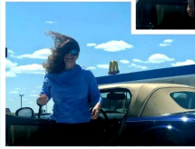
Long hair and 25 mile winds = a natural wind blown look!