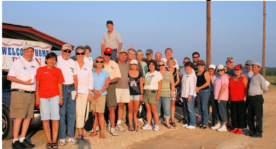
2008 NASCAR Run