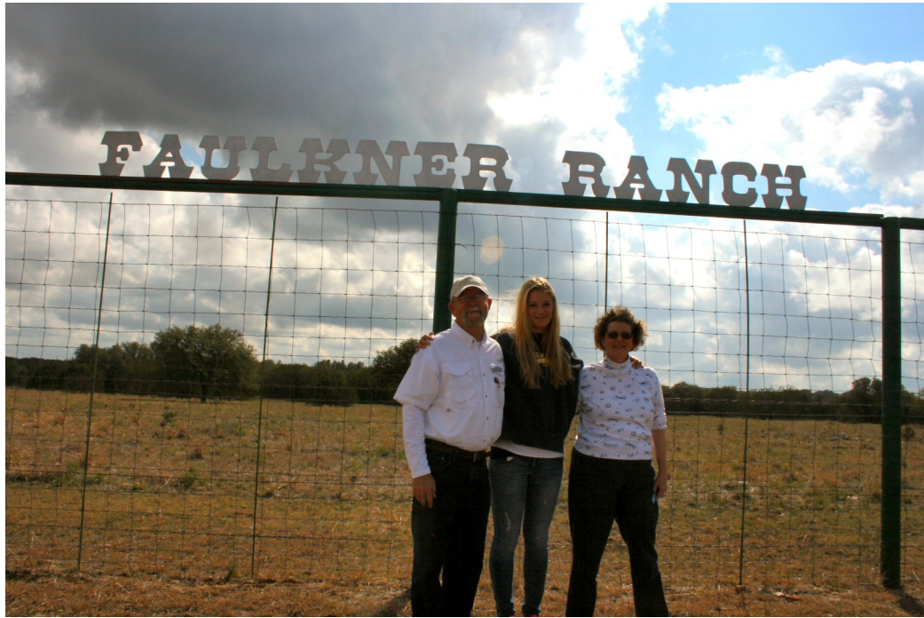
2011 BBMC Kerrville Faux Statewide