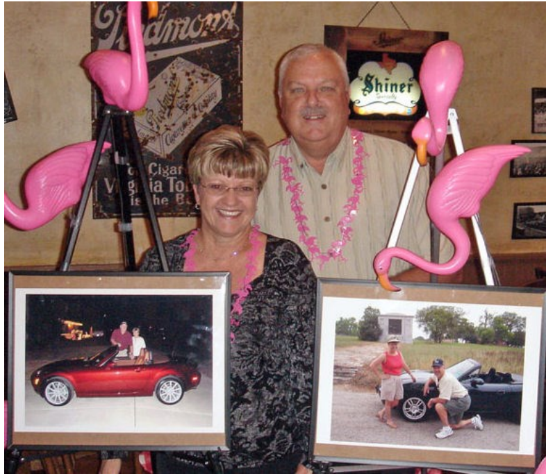
Refreshments at the Faulkner's after the Wildflower Run, 2008