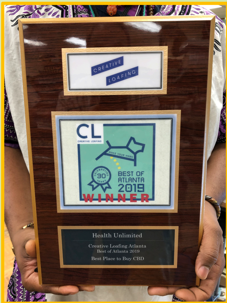
Local business recognition awarded to Health Unlimited, LLC for “2019 Best Place to Buy CBD”