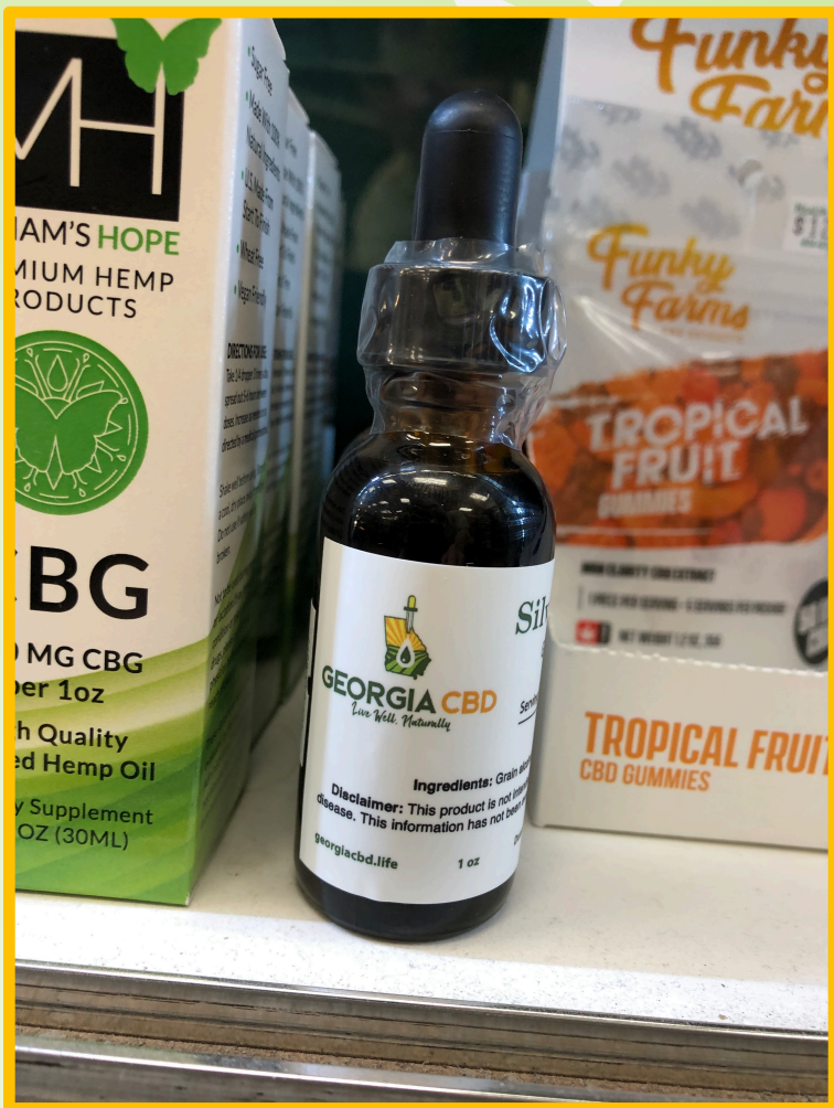
Georgia CBD Distributors’ products on Health Unlimited, LLC shelves!