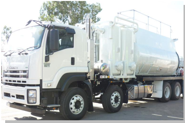
The Air VAXX-DGR Tipper Tanker