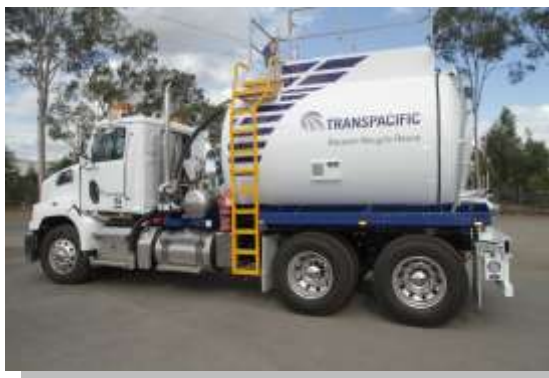
The Air VAXX Liquid Waste Pressure & Vacuum Tanker