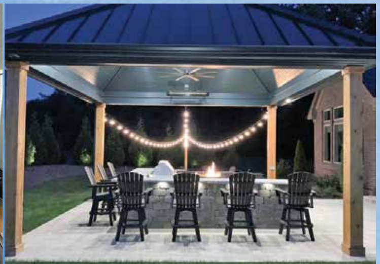
Custom Pavillion Roof