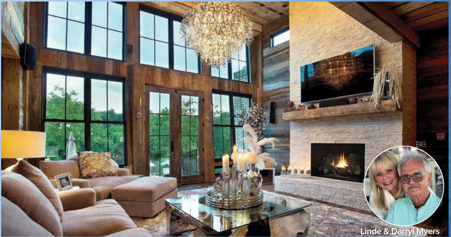
Linde & Darryl Myers