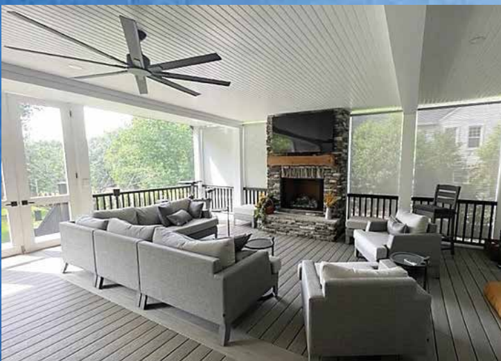
Magna Track Powers Screens With Custom Open Patio Roof

AVAILABLE IN 24 COLORS, OPENS AND CLOSES WITH A REMOTE (ALSO CAN BE APP CONTROLLED)