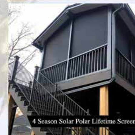
4 Season Solar Polar Lifetime Screens