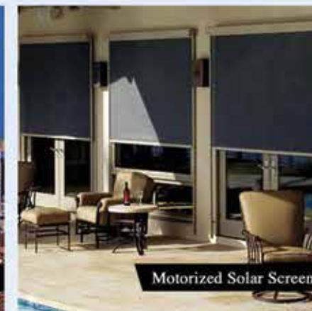
Motorized Solar Screens