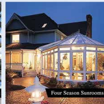
Four Season Sunrooms