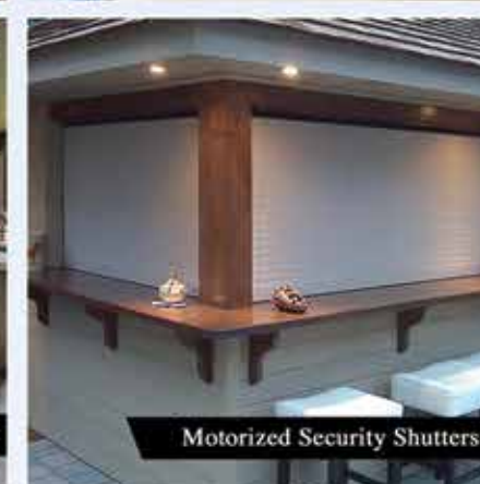
Motorized Security Shutters