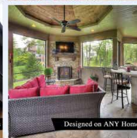
Designed on ANY Home