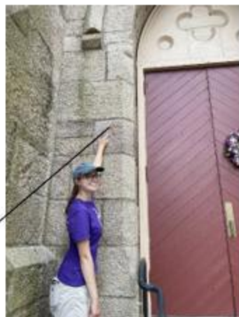
JAMB at the jamb, 2nd Congregational Church, Greenfield MA