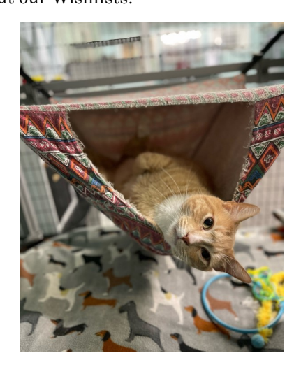
Facility Wishlist: https://a.co/hd1bhVv

If you are shopping locally, you can bring donations by the shelter during any of our open hours or shop at Rainbow Ag or Tractor Supply in Ukiah and leave your donation in our donation bin at the front of their store.