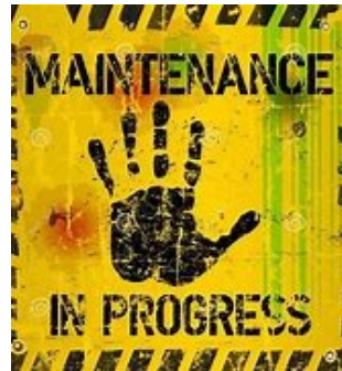
Facility Wishlist: https://a.co/hd1bhVv

If you are shopping locally, you can bring donations by the shelter during any of our open hours or shop at Rainbow Ag or Tractor Supply in Ukiah. Just leave your donation in our donation bin at the front of their store.