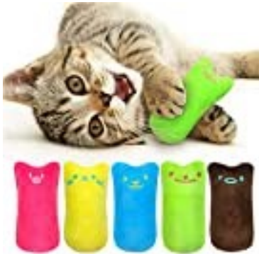
Furry Friends: https://a.co/4HHPNLN