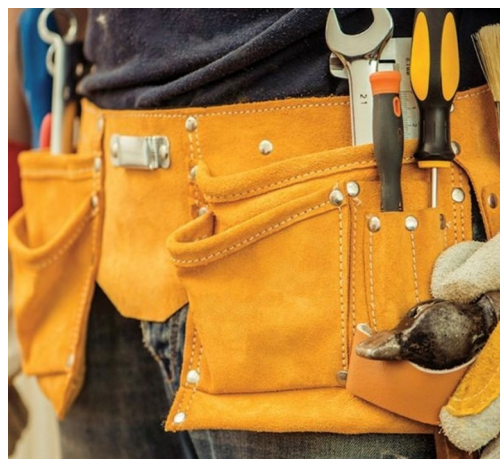
Facility Wishlist: https://a.co/hd1bhVv

If you are shopping locally, you can bring donations by the shelter during any of our open hours or shop at Rainbow Ag or Tractor Supply in Ukiah and leave your donation in our donation bin at the front of their store.