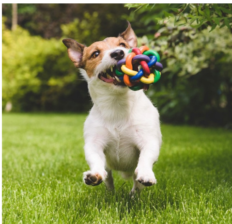
Furry Friends: https://a.co/4HHPNLN

Click the links below and check out our Wishlists: