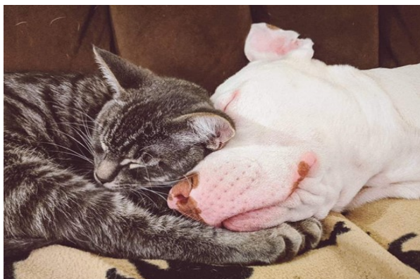
Our Lives are in your Hands