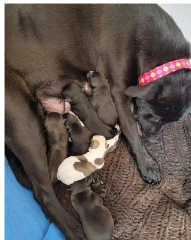
Momma & her puppies