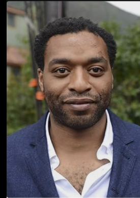
Chiwetel Ejiofor- Coach