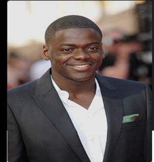
Daniel Kaluuya- Oldest Will