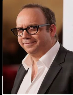
Paul Giamatti - Fitzy