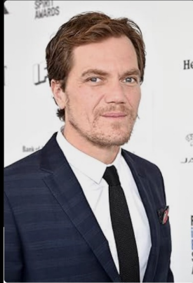
Michael Shannon- Mr. Roberts