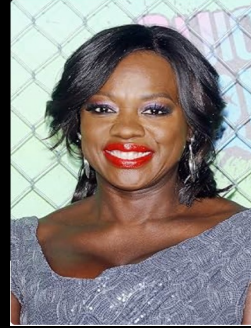
Viola Davis- Shirley