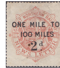
Ex Lot 16