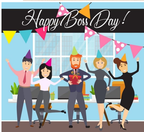
October 16th is National Boss's Day