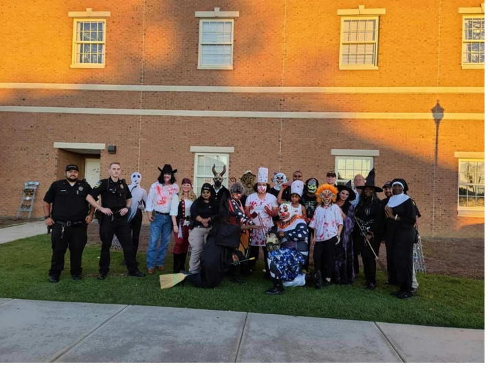
SPD Celebrates Halloween

Sylvester Police Department celebrated Halloween on October 30<sup>th</sup> with the community and fun was had by all. They gave out candy and had a small walk through haunted house called the Spooky House of SPD. The children were able to see the officers dressed in costume which was phenomenal.