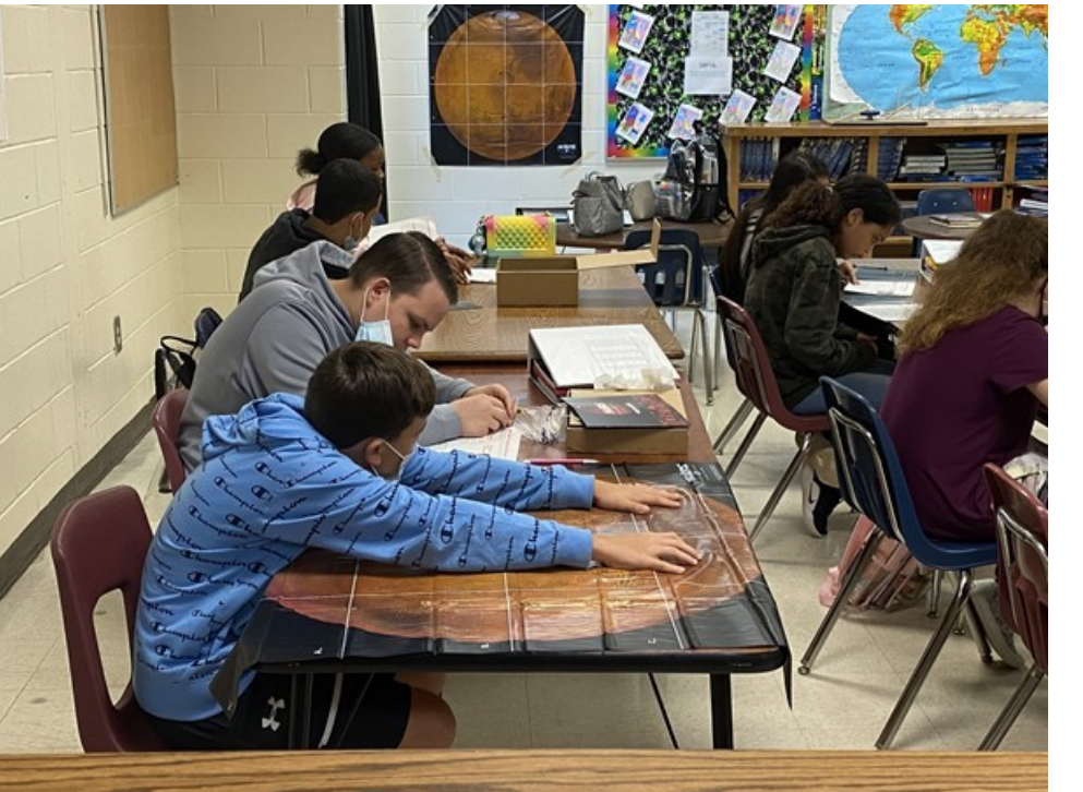
In partnership with Fort Valley State University 4H, WCMS students participated in the 4H National Youth Science Day Challenge. Students completed a variety of STEM activities in science classes, including building a STEM Rover, Landing Zone Surveyor, Crop Curiosity card game, and Insight from Mars coding. We would like to extend a special thanks to Bayer for providing the Mars Base Camp kits.

The Martin News Sylvester, Georgia 11-2-2020