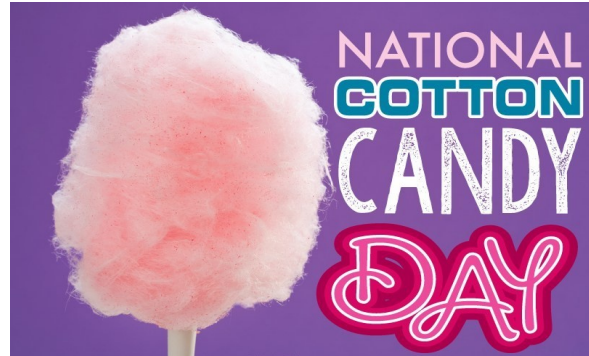
Monday is National Cotton Candy Day! Do you like Cotton Candy? I love it! My favorite color is the blue or the pink and blue mixed. You can even buy buckets of Cotton Candy in the stores now. The Dollar Tree has small buckets of Cotton Candy that would be great for stocking stuffers or just as little gifts to drop off to friends. This week is the Carnival in Sylvester which is a great place to find Cotton Candy too!

GEMA To Help Georgians Prepare For Upcoming Winter Weather