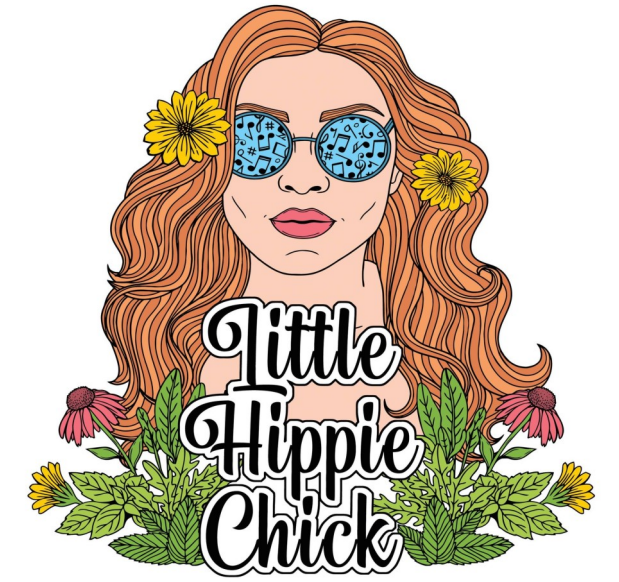
Where local art and music meet natural living