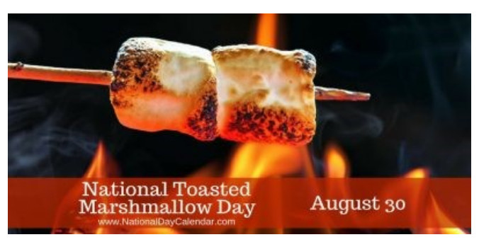
Marshmallow Roastin' Time Is A Comin'

Well it's still a little too warm in South Georgia to have a night around the fire pit roasting marshmallows but the days will be here before we know it. Are you ready? I know I am! I love the cool days of fall where we can wear sweaters and boots and enjoy outside time with friends and roast those marshmallows. Fall is on the way!