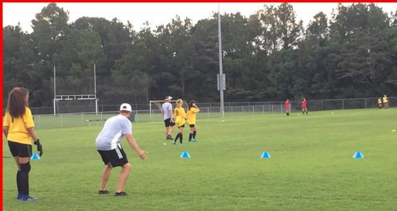
Tifton Sports complex, my granddaughters Soccer practice