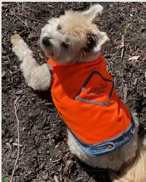
Ralph the Camp Supervisor