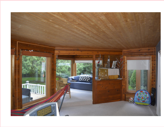
Play time or down time in our 3 season room