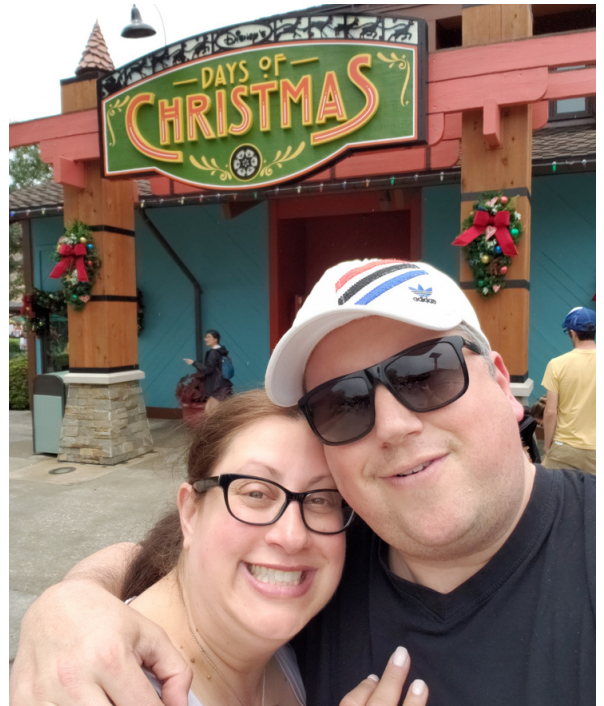
Picking the many fruit at our cottage Christmas store at Disney! Why not