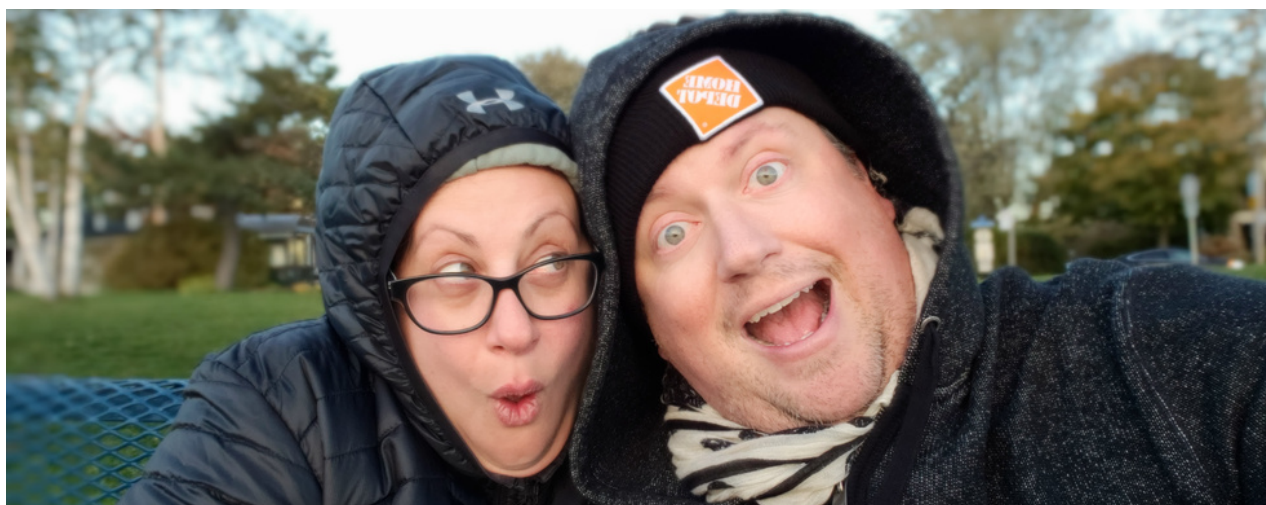
A fun cold day out at the park :)