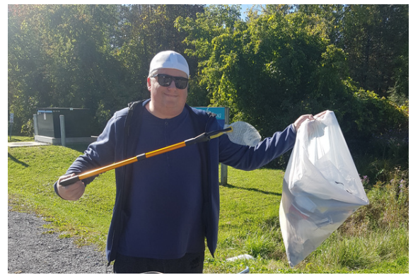
Parks & Streams cleanup day. We take pride in keeping our local community clean.