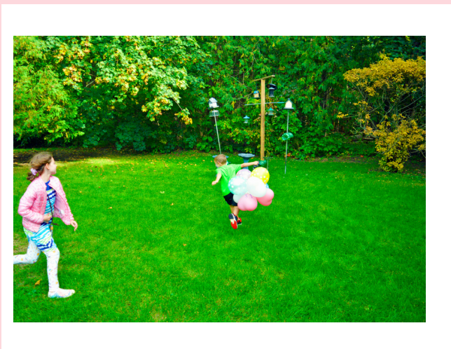
Lots of space to run and play.