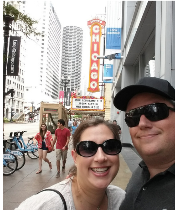
Loving that fresh Cuba ocean breeze! Shopping and Theatre in Chicago!