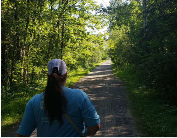
Paths and streams to explore