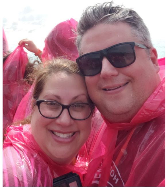
Happily soaked in Niagara Falls!