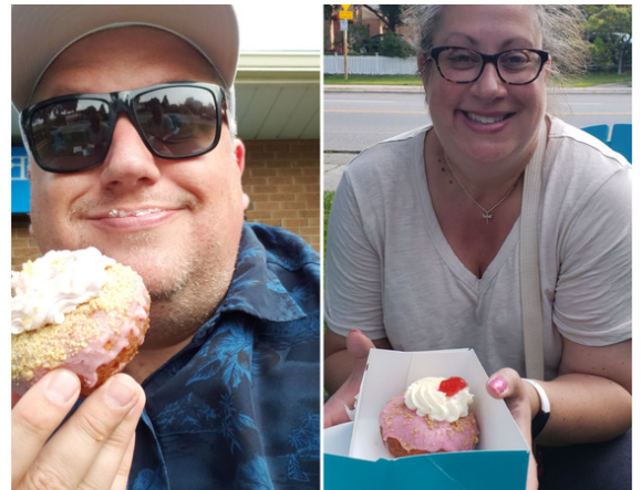
The best donuts in town 3 blocks away