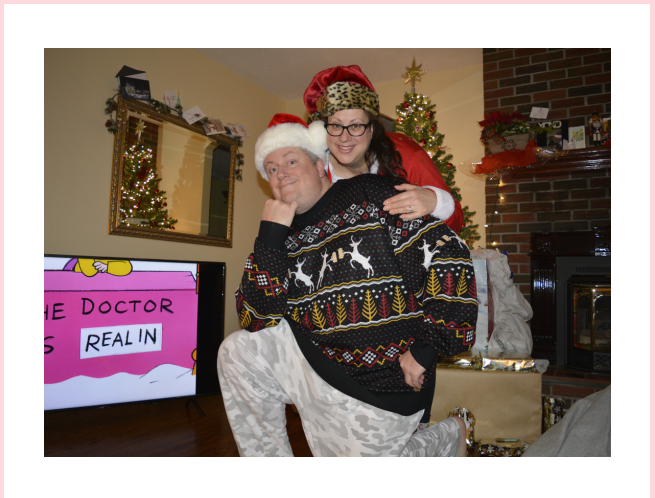
Super warm and fun living room