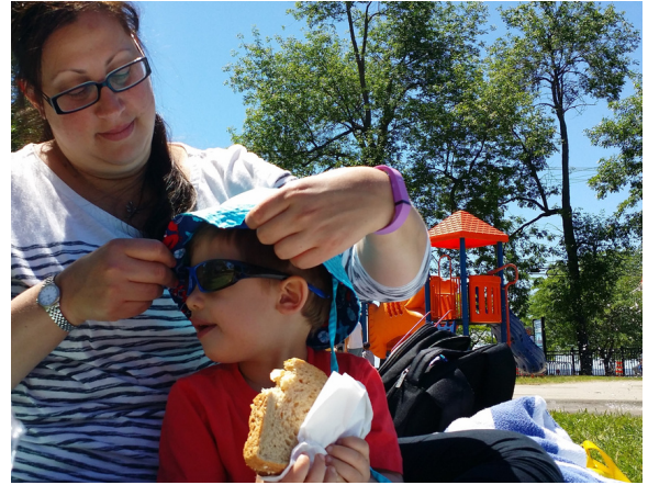
7 Parks & 2 Schools next door