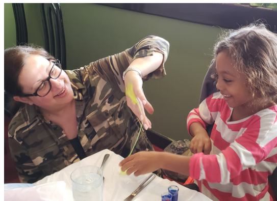
Craft time with a cousin