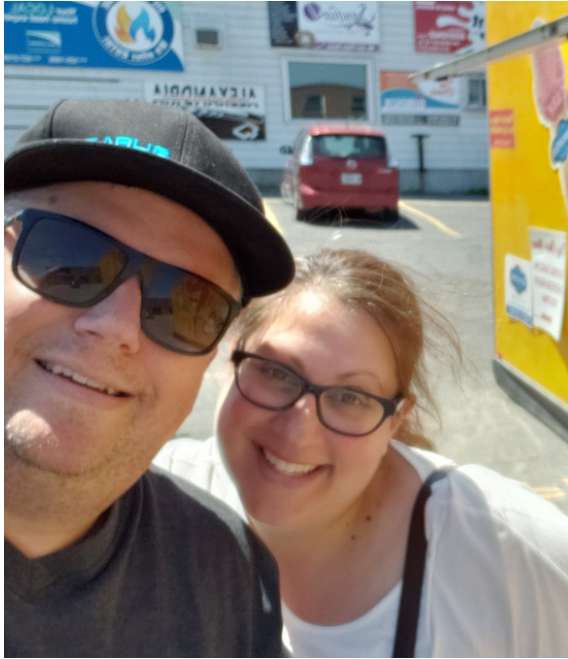
We love exploring new food trucks!