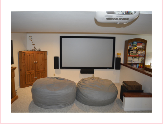
Prep the Popcorn, it's Movie Night in the cozy finished basement.