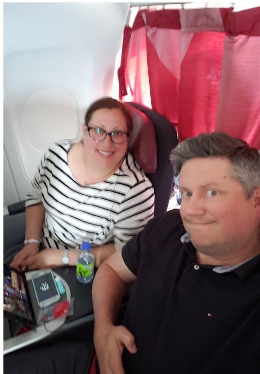
On way to see Mickey!

Our life is filled with love and we cherish every memory, big or small.