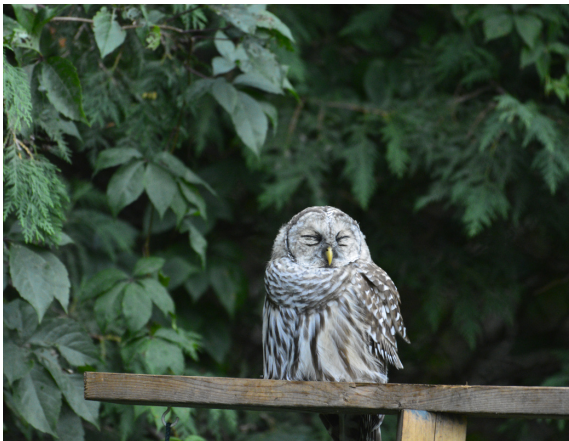
Backyard visitor. Photo by Shane :)