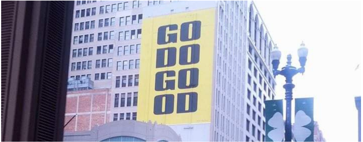
An inspirational sign in Chicago which reads "GO DO GOOD"