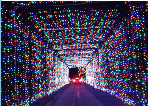
The famous Magic of Lights minutes away!