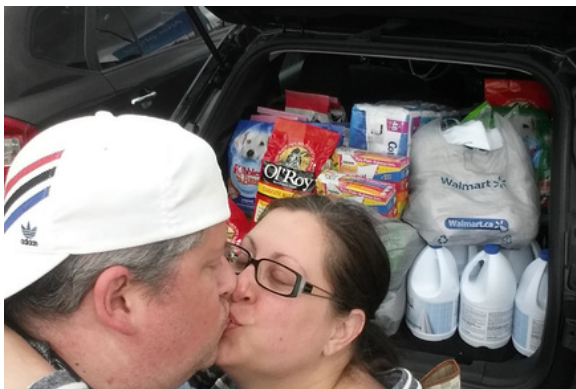
A quick kiss and a car drop-off of donations for the flood victims and those in need.