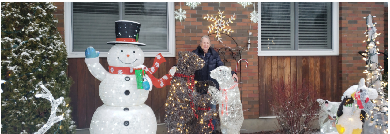
Our dearest neighbour and friend proudly showing off her Christmas lights!