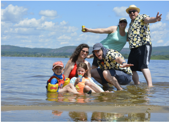
A day at the beach with friends