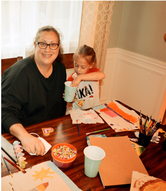
Always time for craft time!