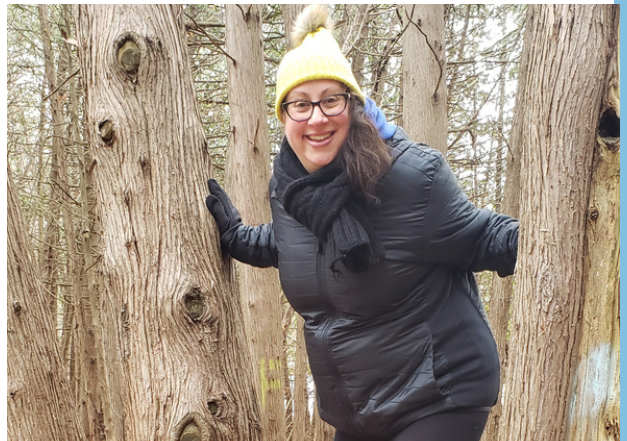
Enchanted forest and streams 2m walk