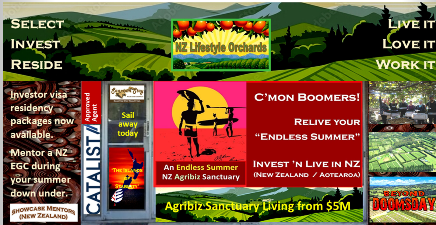
Above. A concept render of our "repurposed" realty office in Ft Lauderdale.

TRANSFORM your capital raising with (1) an ownership stake in a US Showcase that gives you first access to HNWI's with millions of USD's to invest in NZ, this delivering (2) ongoing fee income streams and passthrough distribution on American "Residency-By-Investment" FDI in NZ plus (3) an ROI on the Showcase ownership stake.