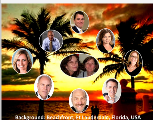
Background: Beachfront, Ft Lauderdale, Florida, USA

Through the Showcase base, Linda has setup a US support team in the key service support areas typically needed to assist NZ owned, Showcase listed companies to expand / launch business operations in the US.