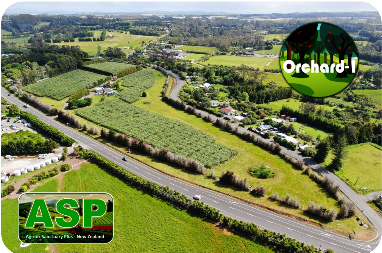
“Orchard-1” 1659 State Highway 10, RD3 Kerikeri 0493, Bay of Islands, New Zealand