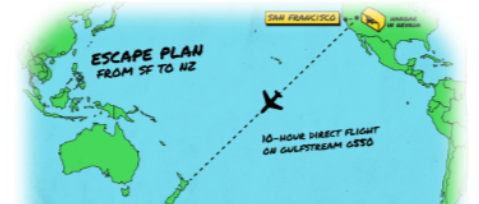
Just a 10 hour flight in a private jet across the Pacific pond to your NZ sanctuary