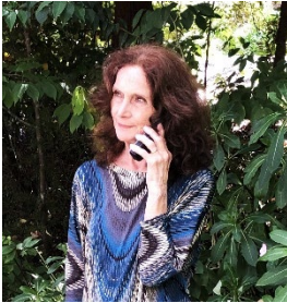
Lost in tea tree bushlands!