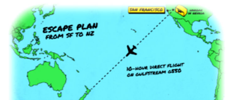
Just a 10 hour flight in a private jet across the Pacific pond to your NZ sanctuary