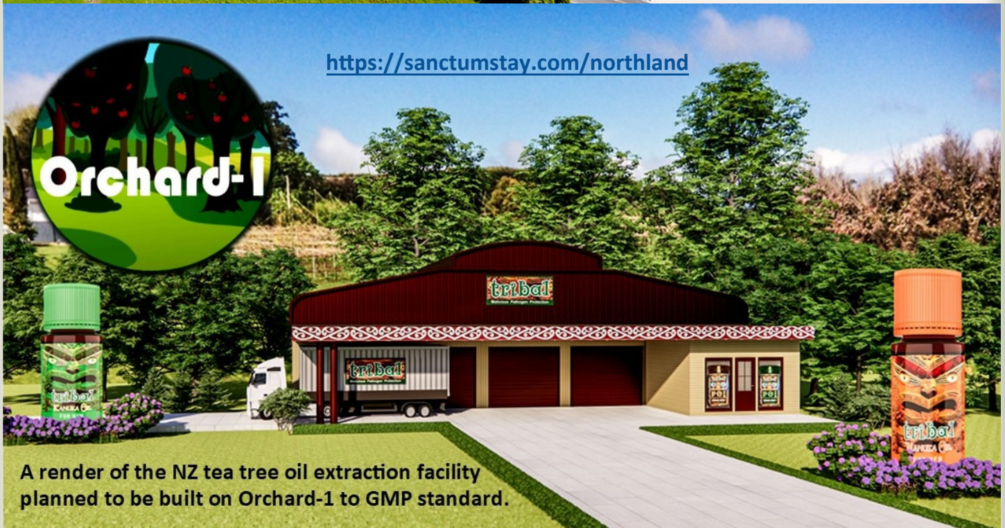
A render of the NZ tea tree oil extraction facility planned to be built on Orchard-1 to GMP standard.

Combine your management skills, capital & US networks. Together these will deliver a truly unique New Zealand agribiz investment giving you and your family a "home-away-from-home" as NZ residents in a safe and secure rural environment.