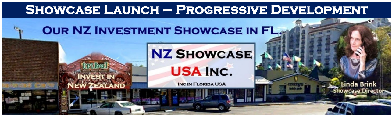
Superb location. 500 yds from where USD200M mega-yachts tie up. The artwork above is a concept render only.