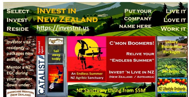
Professional window sign writers will do a much better job!