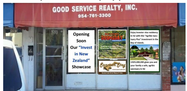
My late mother was “very retro”