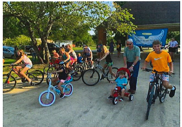
All ages participating in the Bike-A-Thon benefitting Adam's Angels.