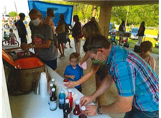
Snow cones were a blessing at bike-a-thon.