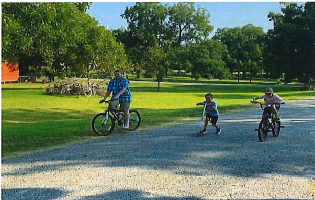
On the road riding for Adam's Angels.