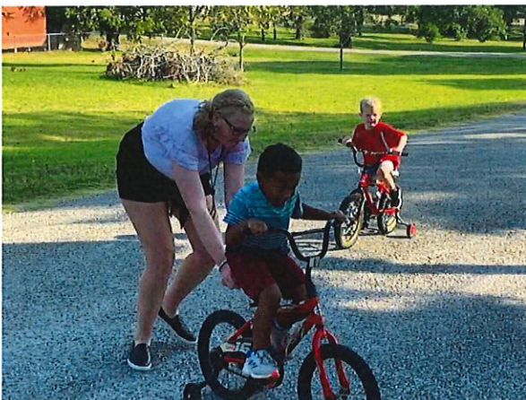
Helping the little ones.