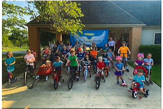
Waiting for the start signal.