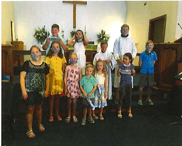
Children receive masks and back to school blessing at 10.