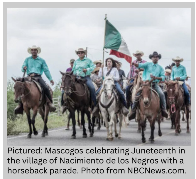
Pictured: Mascogos celebrating Juneteenth in the village of Nacimiento de los Negros with a horseback parade.

Although only a few hundred Mascogos live in Nacimiento de los Negros today, they continue to celebrate Juneteenth in much the same way they have for more than 150 years – with a parade of horseback riders, songs, family, friends, and food.