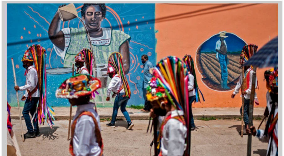
En la foto: Mascogos celebrando el 19 de junio en el pueblo de Nacimiento de los Negros con un baile.

Después de que se anunció el fin de la esclavitud el 19 de junio de 1865, pasaron algunos años más hasta que se corrió la voz hasta el pueblo de Nacimiento de los Negros. Los que vivían allí inmediatamente comenzaron a celebrar "El Día de Los Negros." Sintieron el parentesco con aquellos que fueron liberados de las ataduras de la esclavitud en Texas. Los negros de ambos lados de la frontera estadounidense eran ahora completamente libres.