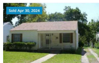
$559,000 3 bd • 1 ba • 980 sqft 7603 Kaywood Drive, Dallas, TX 75209