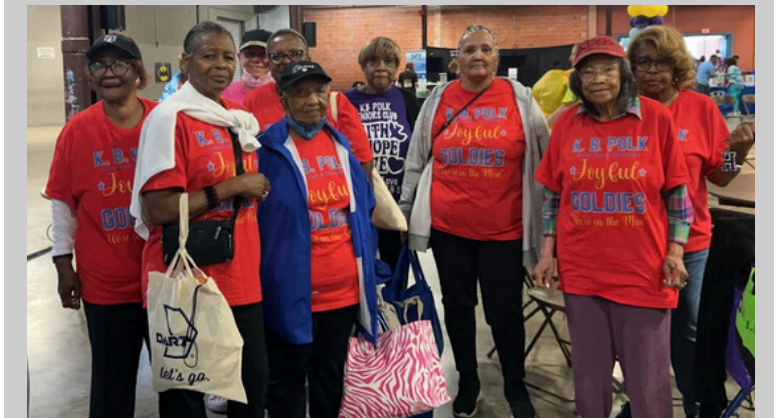
Top: Attending the “Elegance in Bloom” Mother’s Day Luncheon. Bottom: Enjoying the Older Americans Month Celebration.