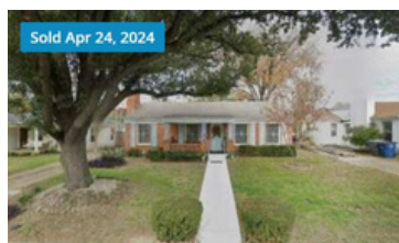
$535,000 2 bd • 1 ba • 1,415 sqft 5031 Linnet Lane, Dallas, TX 75209

Because knowledge is power, the ETNP News will periodically post homes that have recently sold in ETNP. We will try to pick homes from each corner of ETNP as well as do a mix of cottages and new builds.