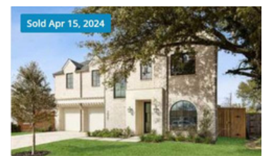
$1,795,000 4 bd • 5 ba • 4,416 sqft 5027 Thrush St, Dallas, TX 75209