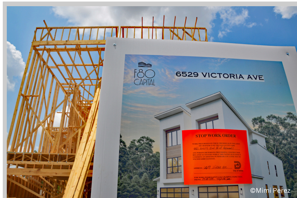
The next appeal involves 6529 Victoria Ave. and will be heard at a September BOA meeting.

More than 40 letters of opposition were sent to the Dallas Board of Adjustment asking the board to deny the appeal of the stop work order issued to the non-conforming duplex being built at 6803 Tyree. The BOA decided at the August 20 meeting to hold the case over to the next hearing date of September 17 so they could gather more information on what action they can take on this case.