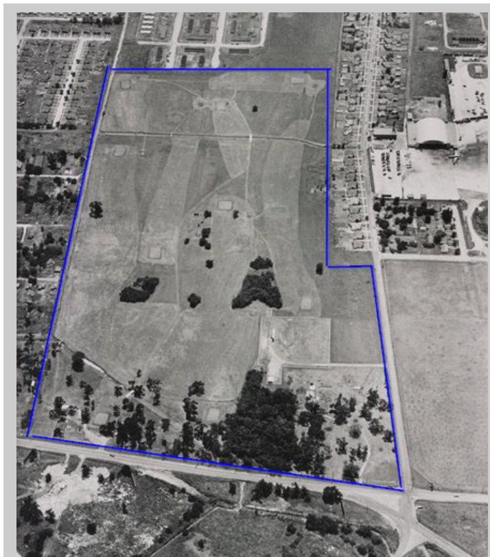
Aerial photo of Hilliard Golf Course.

With the current rate of progress, the ETNP neighborhood can hopefully look forward to witnessing a second unveiling ceremony at next year's Juneteenth Celebration.